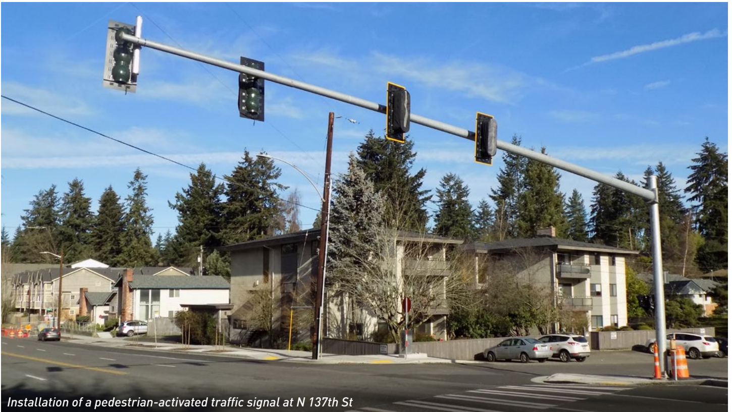
Installation of a pedestrian-activated traffic signal at N 137th St