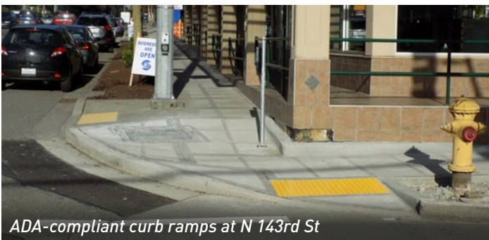
ADA-compliant curb ramps at N 143rd St