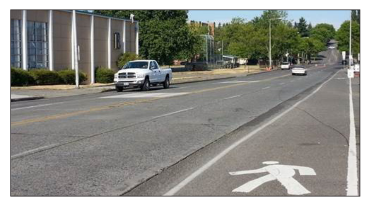
Looking east on SW Roxbury St at 30th Ave SW

We prioritize paving based on pavement condition, traffic volume, geographic equity, cost, and opportunities for grants or coordination with other projects in the area.