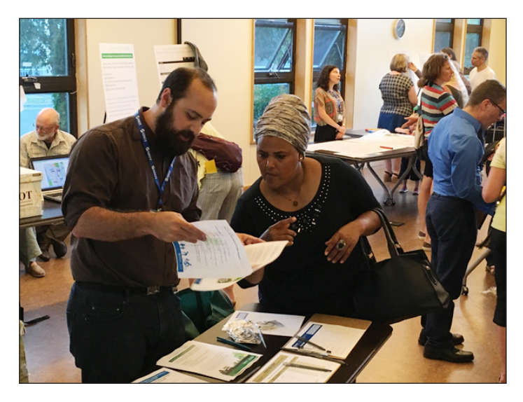
Sharing information at an outreach event