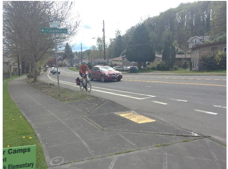
S Columbian Way / S Alaska St needs to be repaved