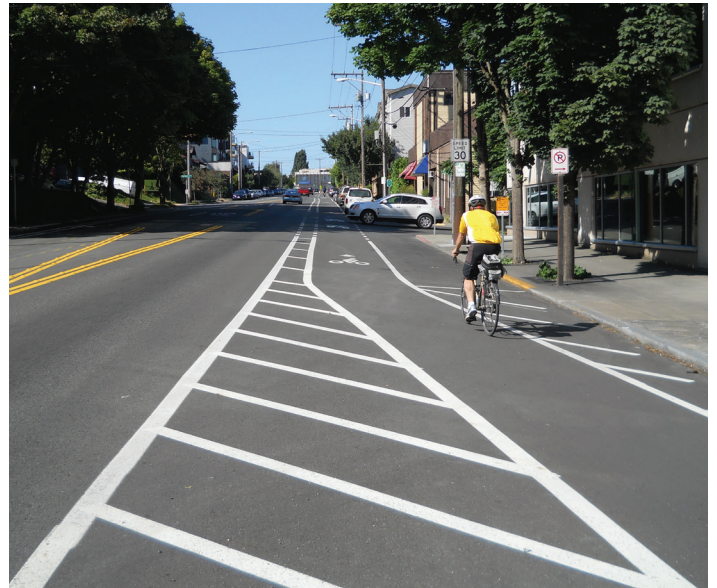
Buffered bike lane along Dexter Ave N