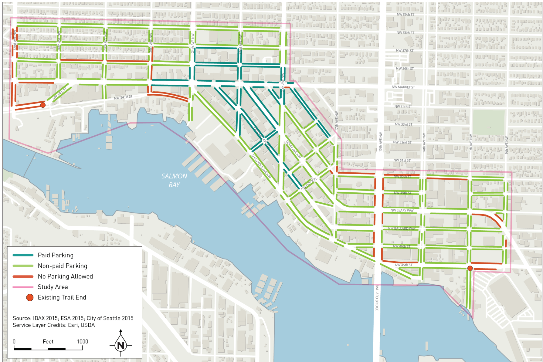
Figure 8-2. On-Street Parking Supply