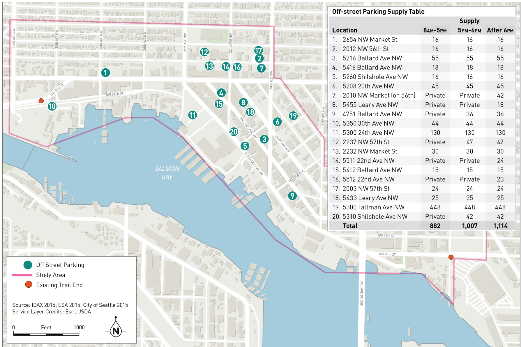
Figure 8-3. Off-Street Parking Supply