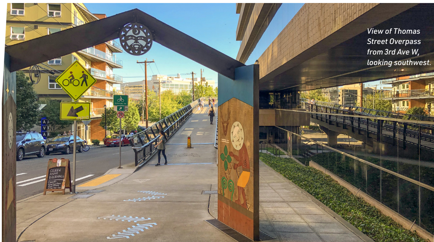
View of Thomas Street Overpass from 3rd Ave W, looking southwest.