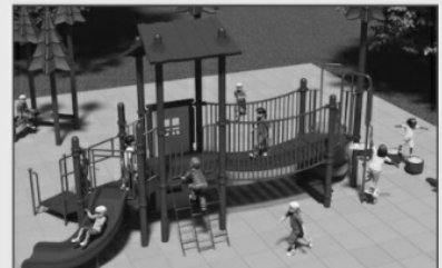
Age 5-12: Multi-Components Play System