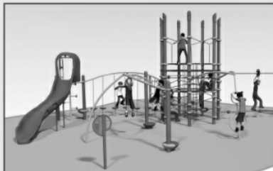
Age 5-12: Composite Multi-Level Climbing System