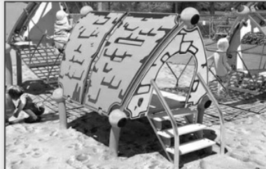
Age 2-5: Small House