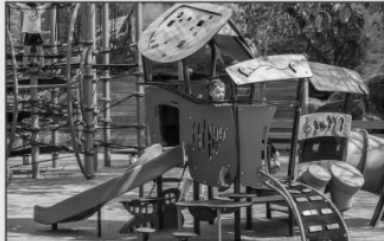
Age 2-5: Interactive Smart Play