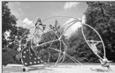
Age 5-12: Round rope Climbing Play System