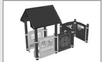
Age 2-5: Active Play House