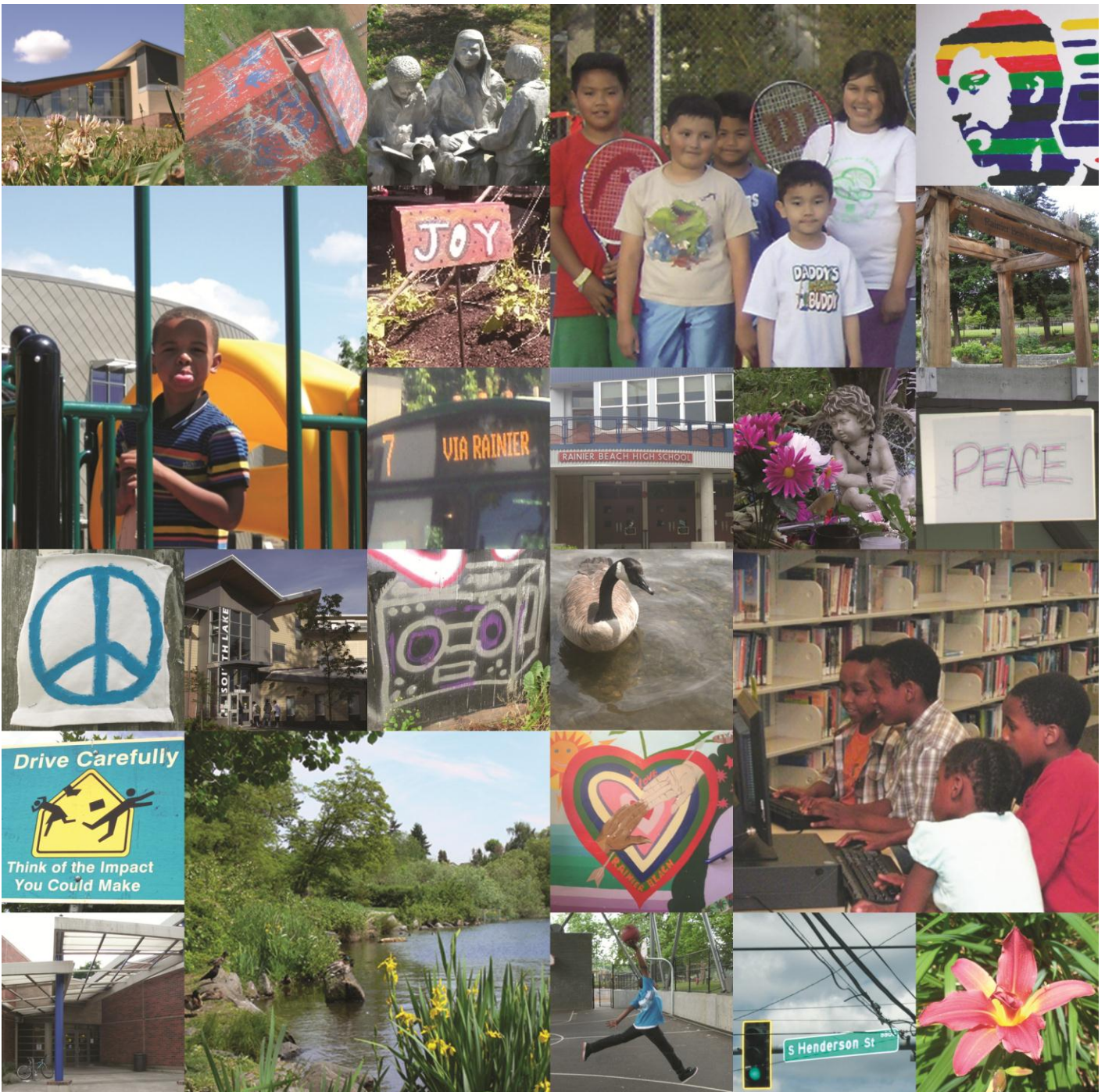
For more information about go to www.rbcoalition.org

A Work-in-Progress, Version 6.1 for more information email rainierbeachmovingforward@gmail.com