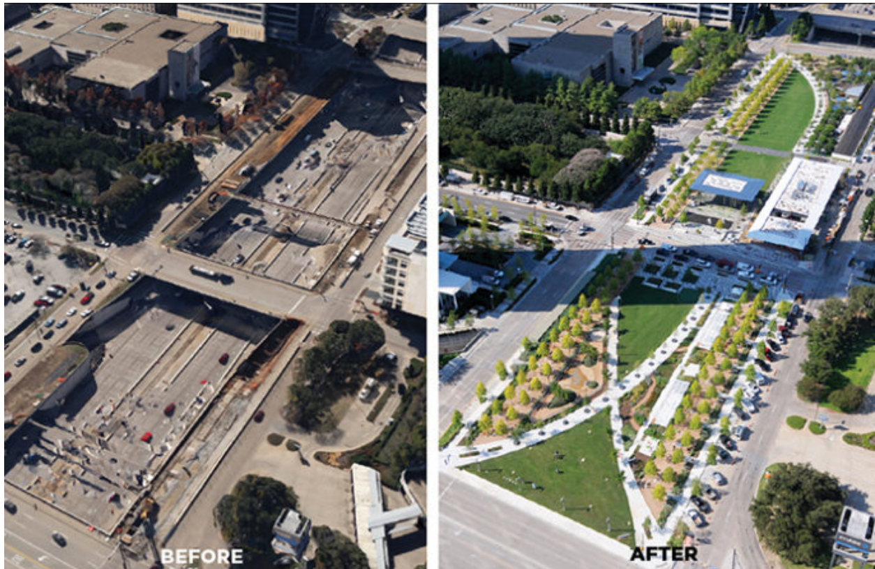
Klyde Warren Park - Dallas, TX

Seattle waa magaalo si xawli u koraysa. Qeyb ka helidda dhul ku yaal bartamaha waxay keeni kartaa faa'iidooyin bulsho, deegaan, dhaqan, iyo dhaqaale. daboolada gudaha magaalada waxaa ka mid ah Xarunta Shirarka ee Gobolka Washington iyo Freeway Park, Seattle Municipal Tower, iyo Aubrey Davis Park oo ku taal Mercer Island.