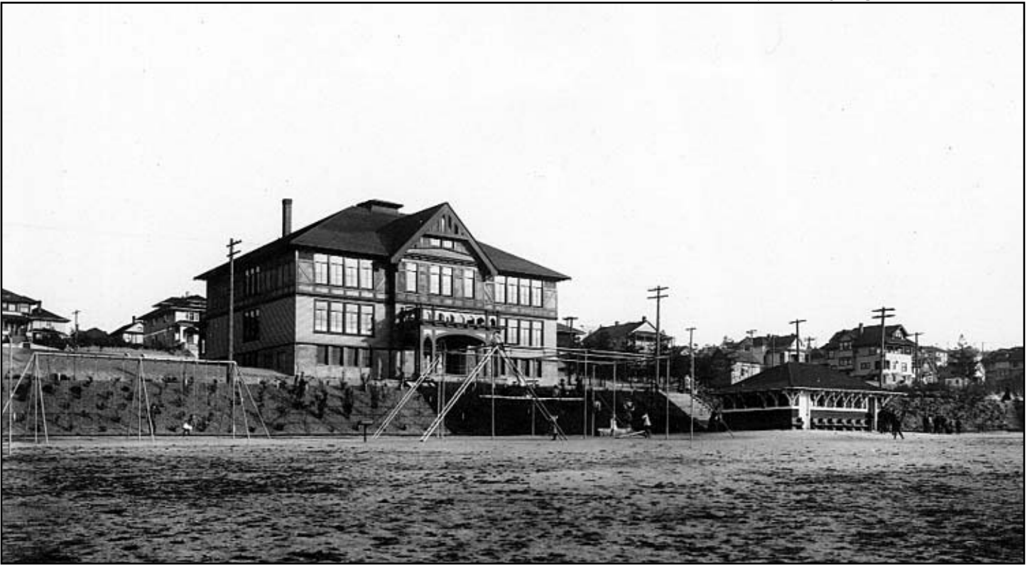
Figure 11. Seward School (Edgar Blair, 1917)