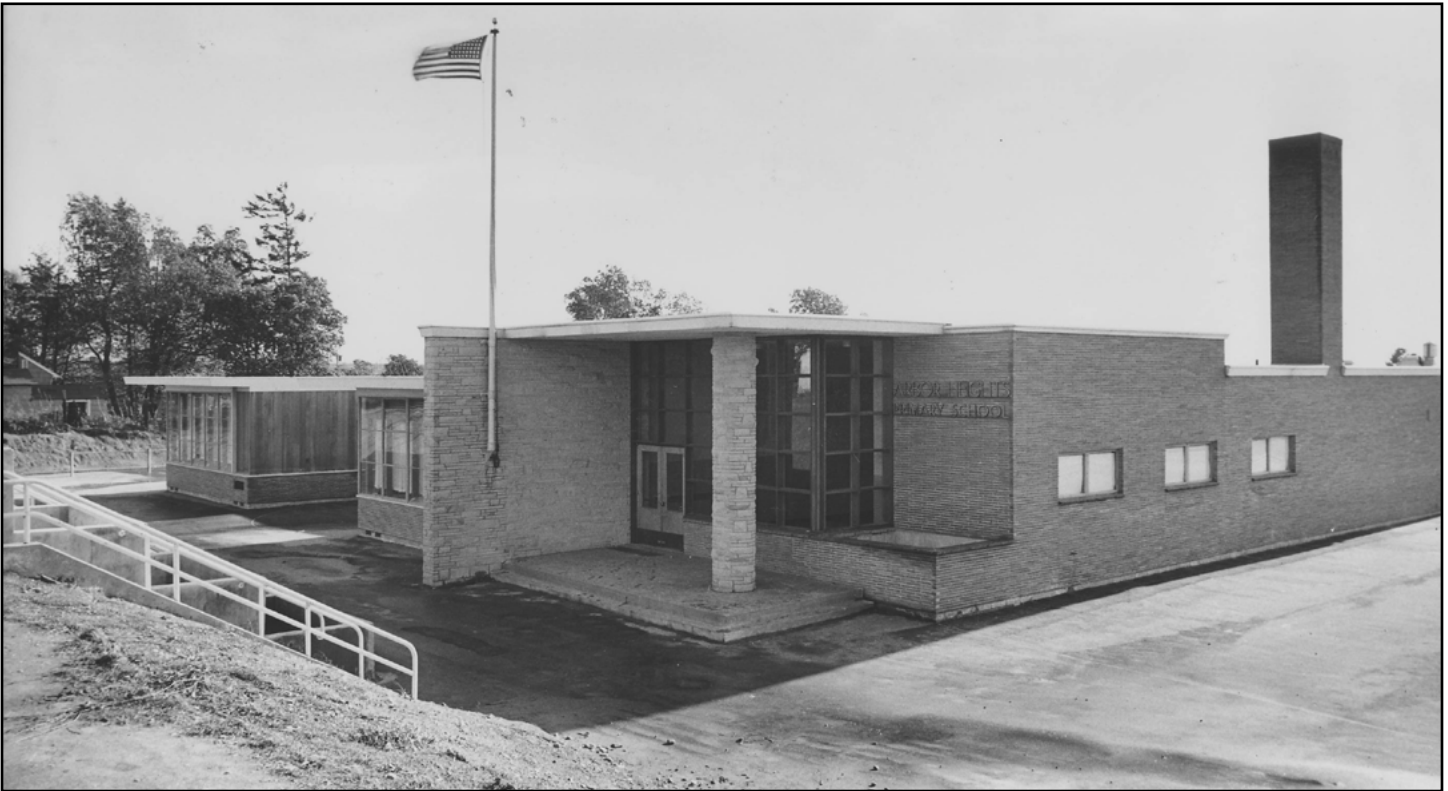
Figure 17. Arbor Heights Elementary (George W. Stoddard, 1949)