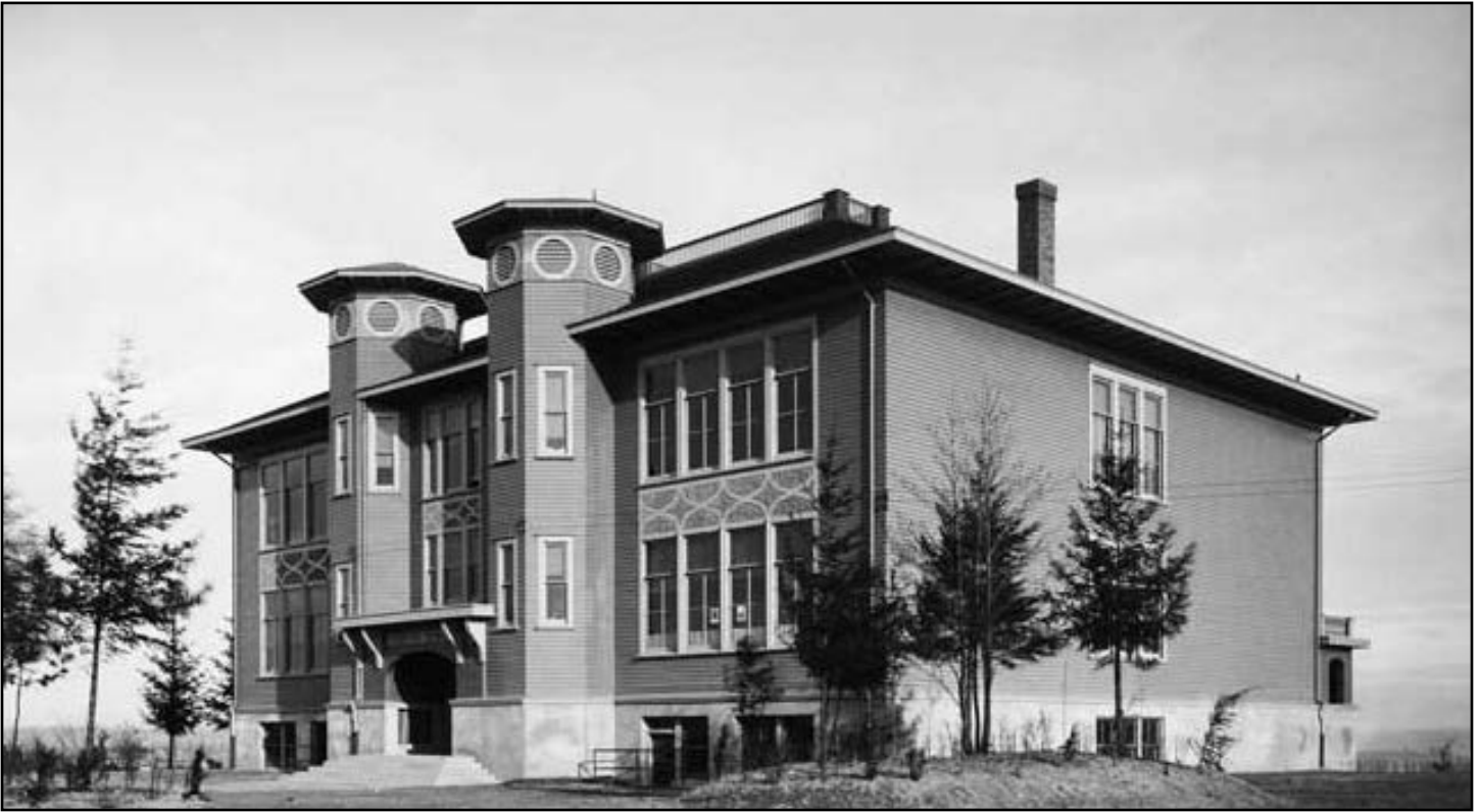
Figure 5. John B. Hay School (James Stephen, 1905, City of Seattle Landmark)