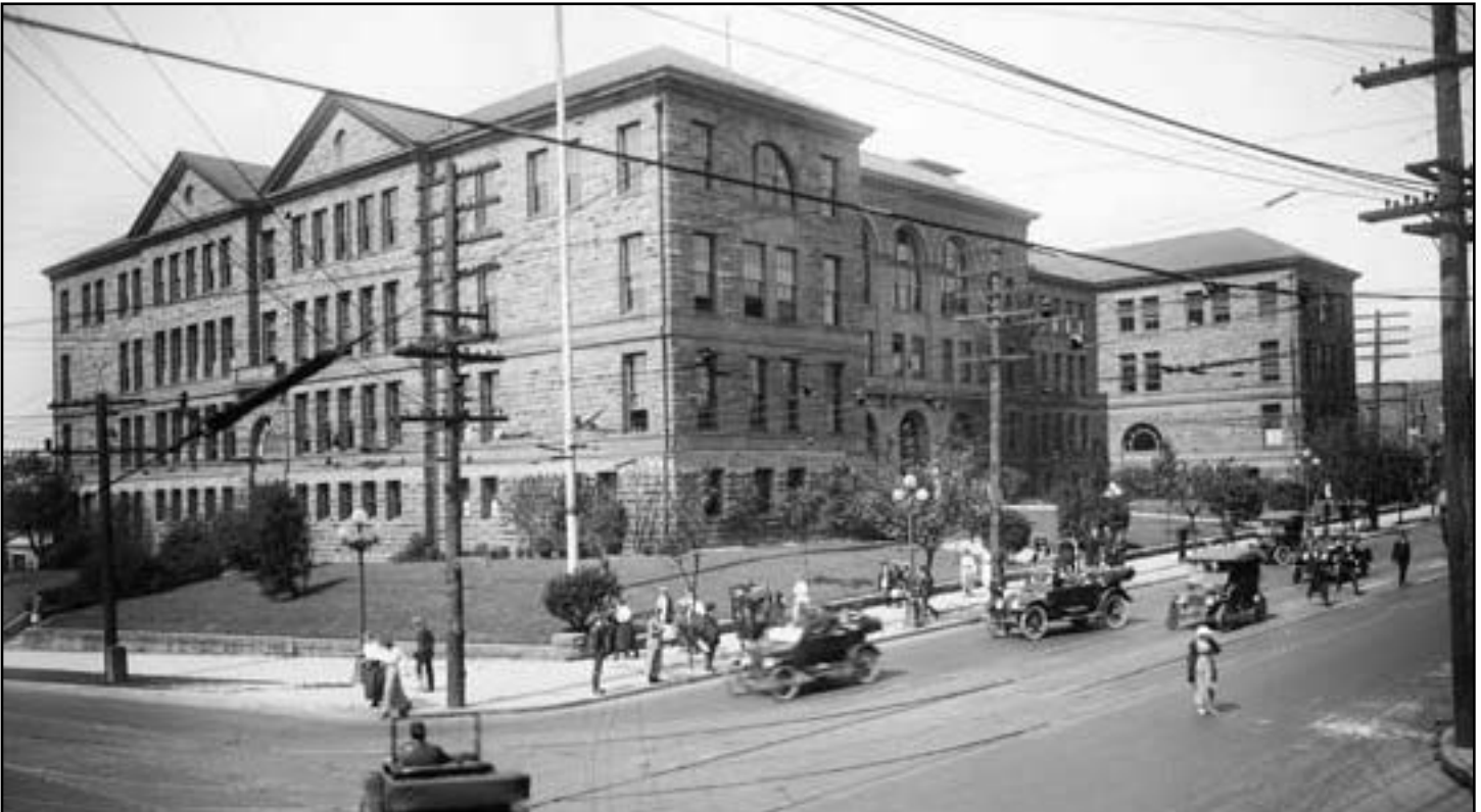
Figure 6. Central High School/Broadway High School (W.E. Boone & J.M. Corner, 1902)