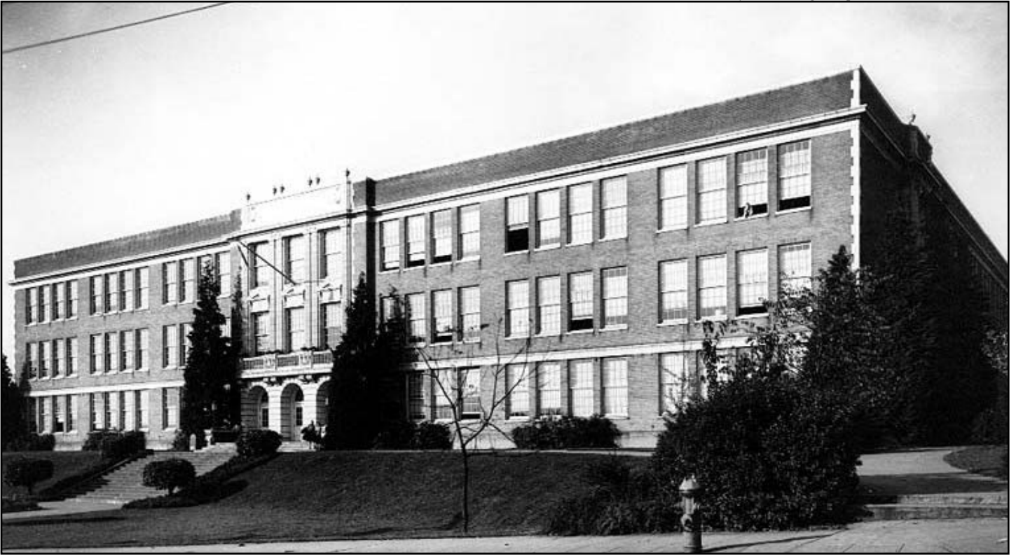
Figure 15. Roosevelt High School (Floyd A. Naramore, 1922, City of Seattle Landmark)