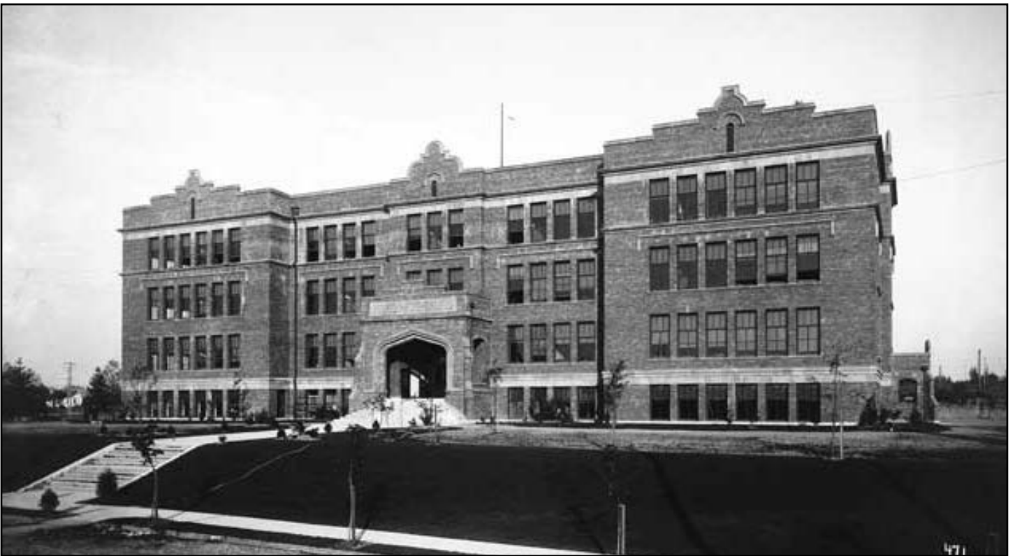
Figure 8. Lincoln High School (James Stephen, 1907, City of Seattle Landmark)