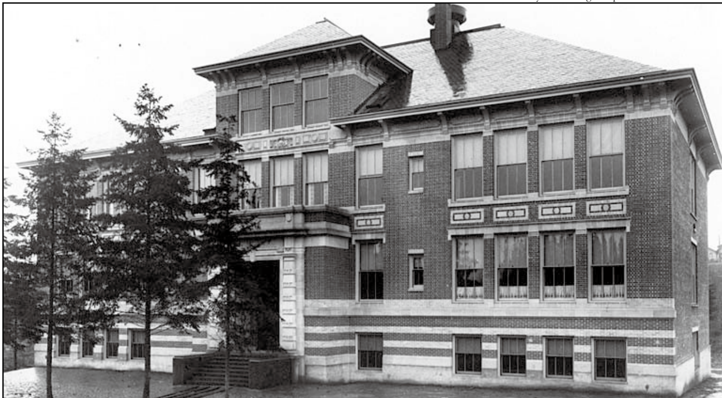
Figure 9. Ravenna School (Edgar Blair, 1911)