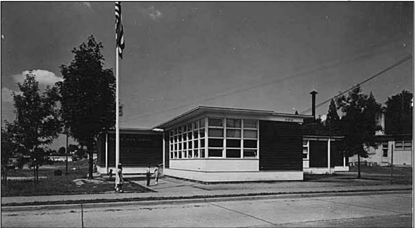
Figure 16. Rainier Vista School (J. Lister Holmes, 1943)