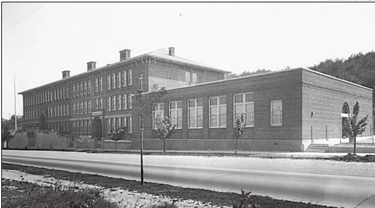
Figure 10. Frank B. Cooper School (Edgar Blair, 1917, City of Seattle Landmark)