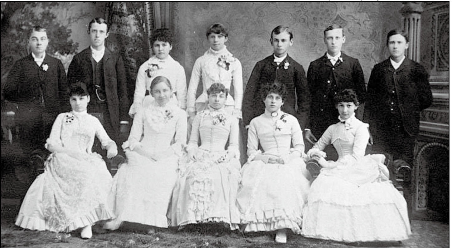
Figure 2. Seattle High School graduating class, June 4th, 1886