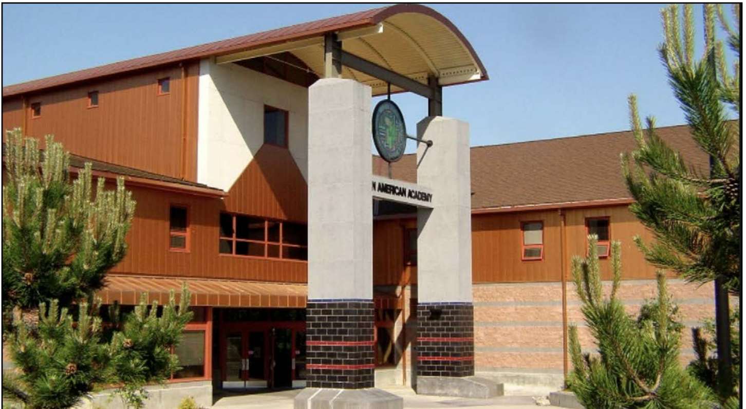
Figure 22. African American Academy, now housing the Van Asselt Elementary program (Streeeter & Associates, 1990)