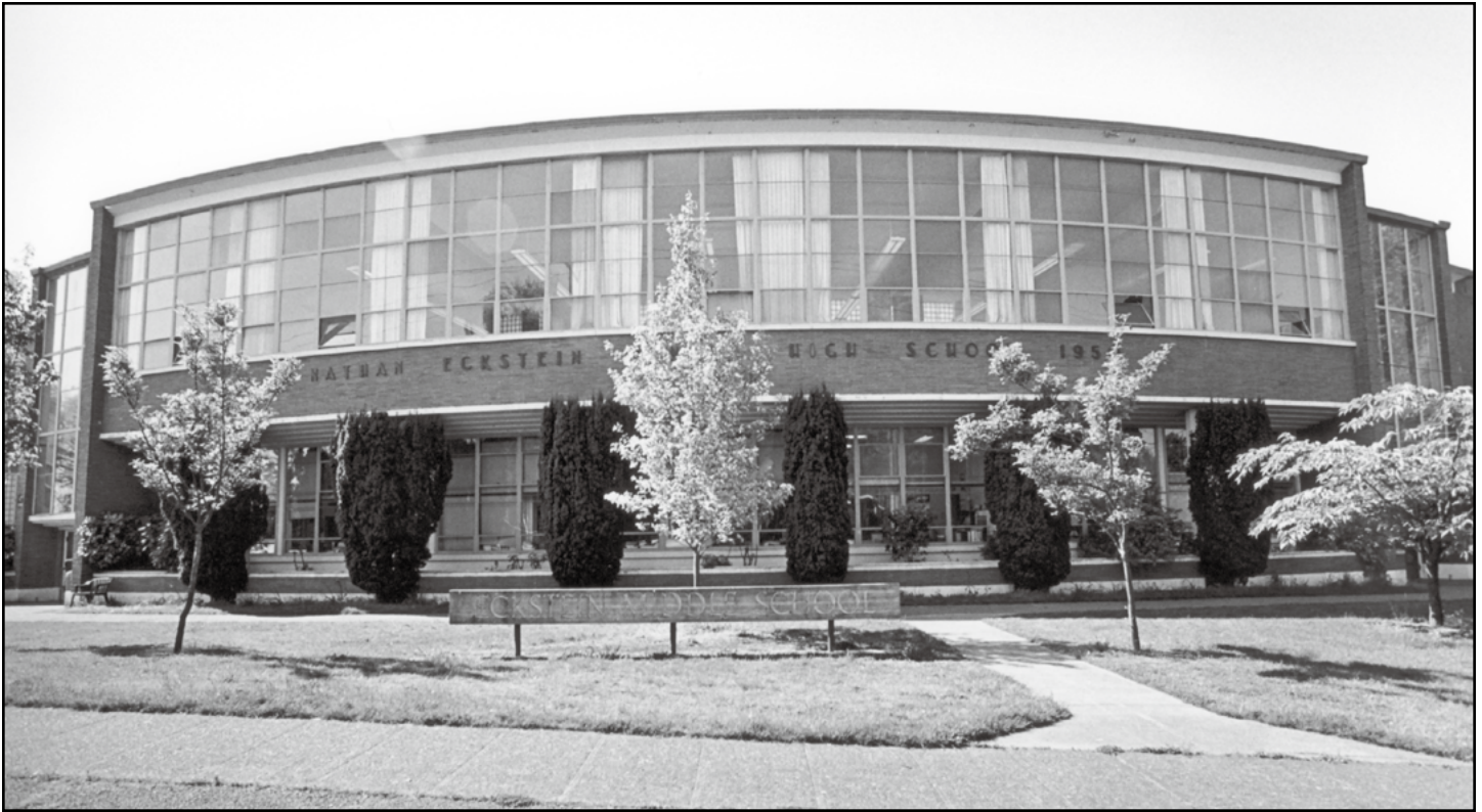
Figure 19. Eckstein Junior High (William Mallis, 1950, City of Seattle Landmark)