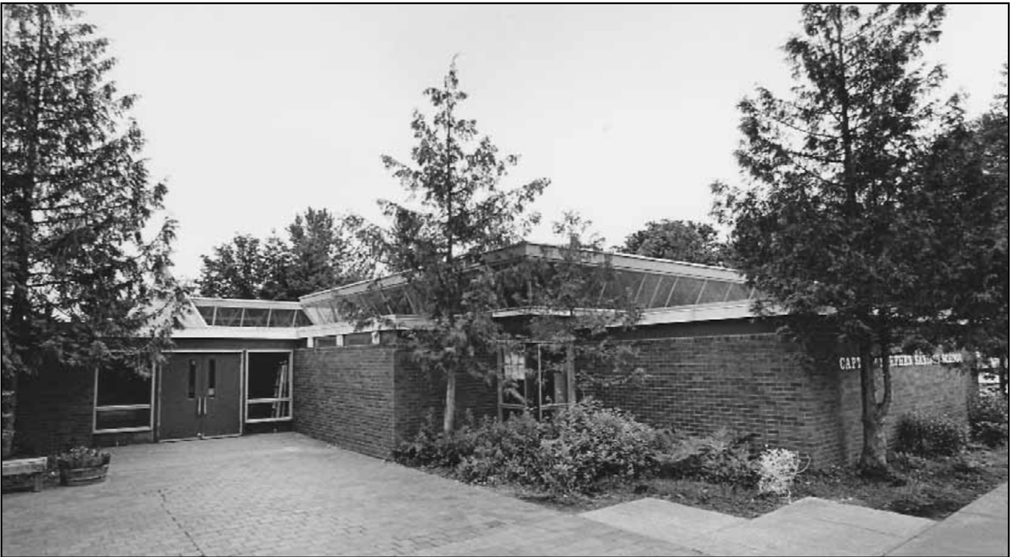
Figure 20. Captain Steven E. Sanislo School (Sullam, Smith & Associates, 1970)