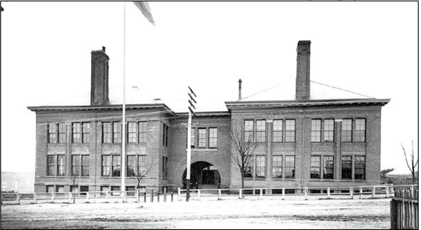
Figure 3. B.F. Day School (John Parkinson, 1892)