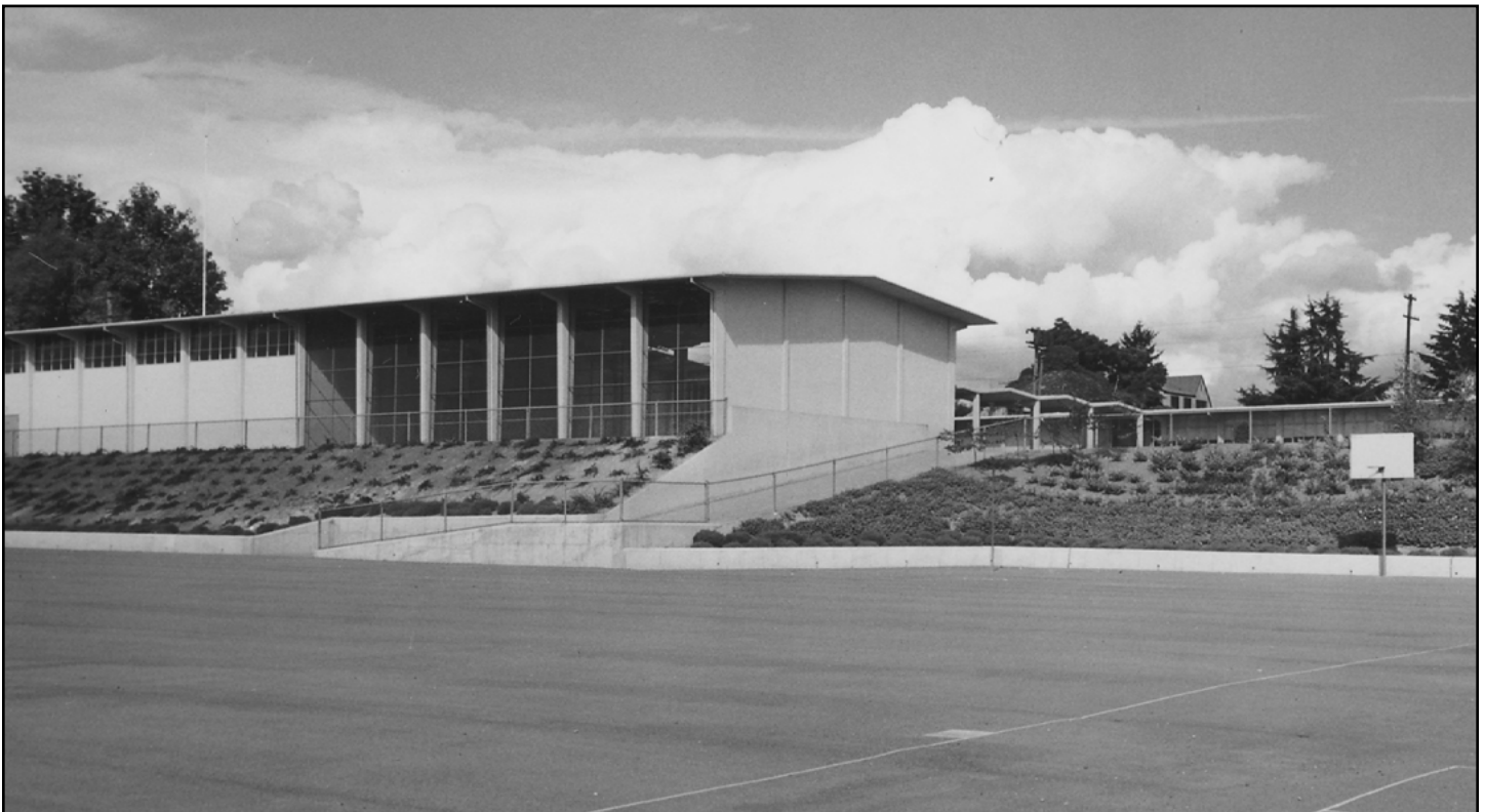
Figure 18. Cedar Park Elementary (Paul Thiry, 1959, City of Seattle Landmark)