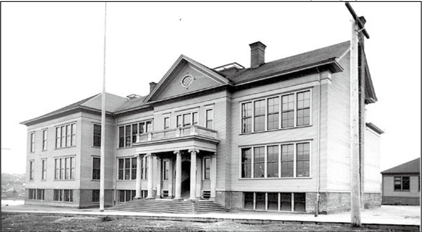
Figure 4. Green Lake School (James Stephen, 1902)