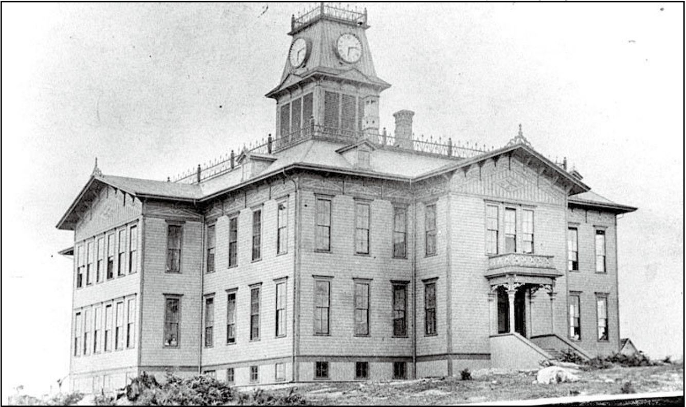
Figure 1. Sixth Street School, also called Central School, 1885 (1883-1888, destroyed by fire)