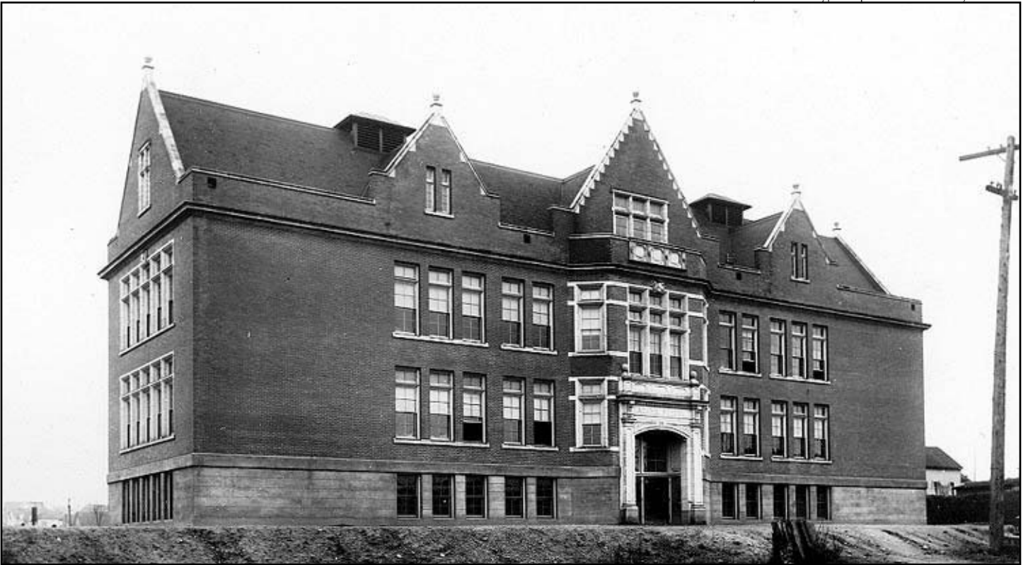
Figure 7. Adams School (James Stephen, 1901)