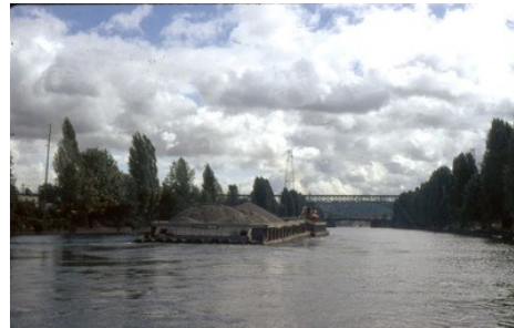
Tugboat, 1978. Item 178791, Seattle Municipal Archives