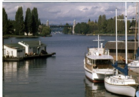
View from Salmon Bay, April 1977. Item 178793