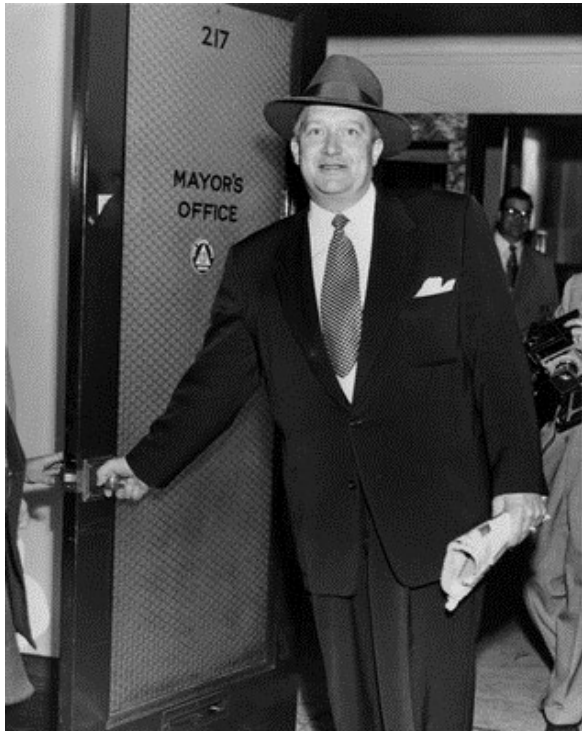
Mayor Pomeroy entering his office, undated. Item 178858

Over forty photographs of Mayor Pomeroy are available online , in addition to the textual records.