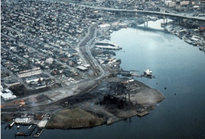
Site of Seattle's Gas Works Park, 1973 Item 177127

One of the most popular images on SMA's Flickr site lately is an aerial view of Gas Works Park, before it became a park. Taken in approximately 1973, the photograph shows the gas plant with the Grandma's Cookies sign behind it.