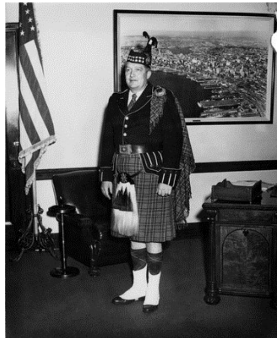
Mayor Pomeroy in kilt, undated. Item 178861, Seattle Municipal Archives

Mayor Pomeroy was invited to attend the test explosion of the atomic bomb. Box 5, Folder 9, Record Series 5267-01, Seattle Municipal Archives