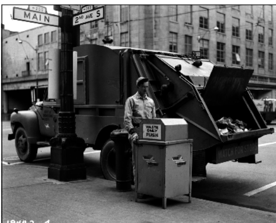
A litter can being emptied on Main and 2nd Ave S, May 1958.