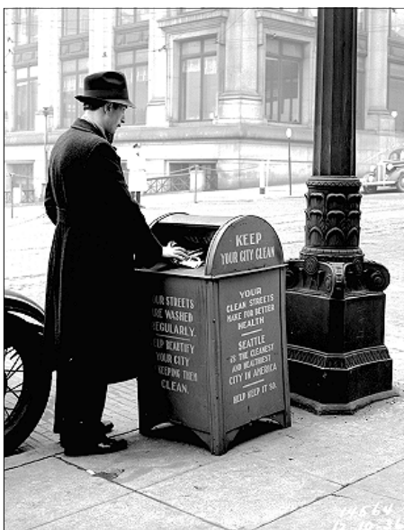
A litter can on Seattle's streets in 1936. The can reads "Keep Your City Clean. Your Clean Streets Make for Better Health."