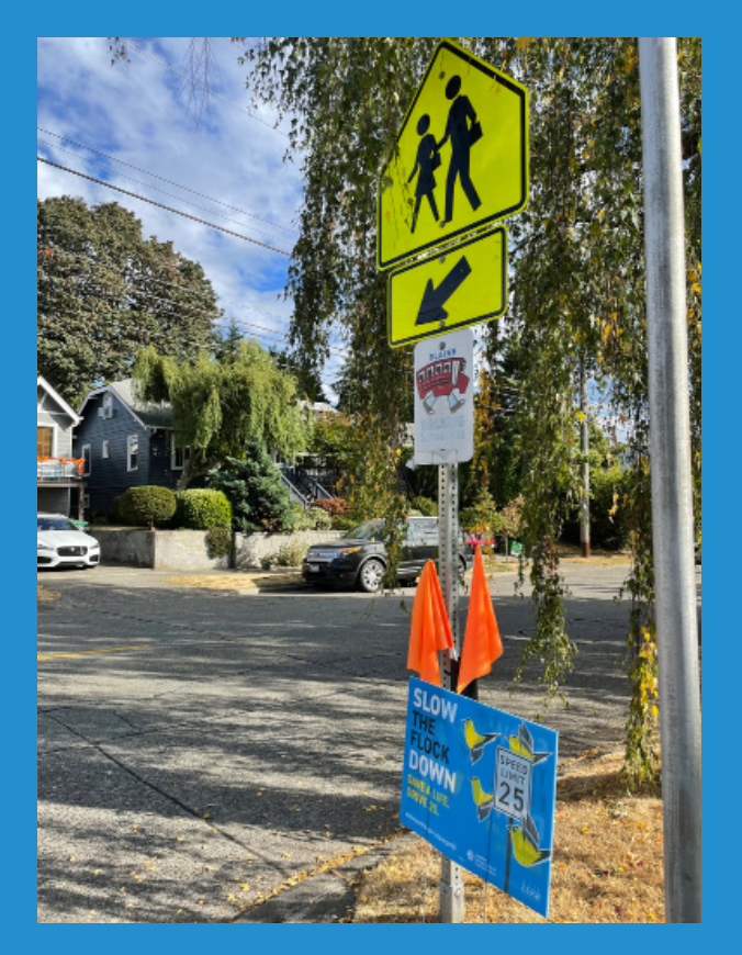
Slow the Flock Down Yard sign at the 28th Ave W and W Raye St crosswalk

In Summer of 2022, SDOT, in partnership with the Portland Bureau of Transportation (PBOT). launched a joint public safety campaign urging drivers to "Slow the Flock Down!" The attention-grabbing public education campaign was designed in consultation with our target demographic--males between ages 16-29--to raise awareness that speed limits have been lowered to 25 miles per hour on most Seattle arterial streets, part of the City of Seattle's larger Vision Zero strategy to end traffic deaths and serious injuries by 2030. In addition to public education efforts, both cities continue to design, build, and implement safety improvements, with a key focus on areas where data shows the most serious crashes occur. The second part of the campaign, "STOP for Flock's Sake," launched in September 2022 and includes education that every intersection is a legal crossing and drivers are required to stop for pedestrians. This work is funded by a $250,000 grant from the Washington Traffic Safety Commission that can only be used for public education.