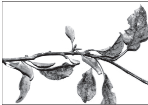
Example of probable mite damage

Most spider mites undergo a life cycle with five stages: egg, larva, protonymph, deutonymph, adult. There are many overlapping generations per year, and in warm weather a generation can take place in a week or less. In warm areas, reproduction can be continuous. In colder areas and on plants that drop their leaves, pests can as eggs on host plants or as adults in ground litter and begin feeding and laying eggs when the weather warms up.