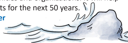
Illustrations by Natalie Dupille

For interpretation services please call 206-684-3000. 如需口譯服務請電 206-684-3000。