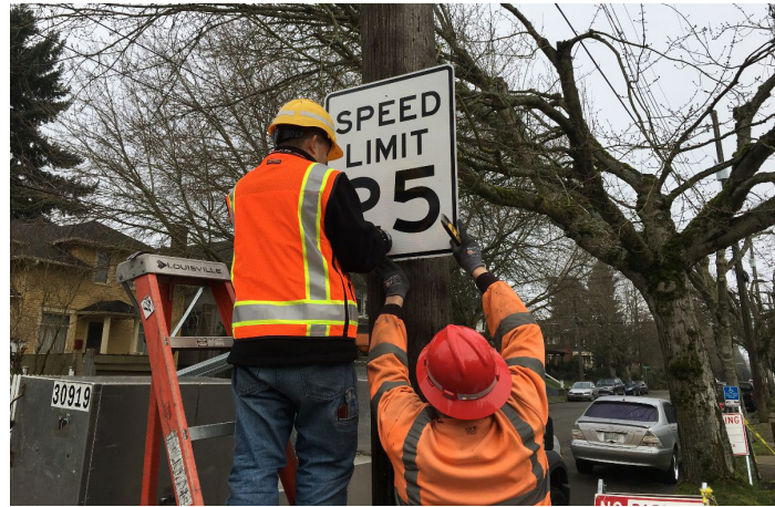
Lower speed limits save lives

Extra! We encourage you to join in creating the Seattle Transportation Plan . No matter where you're going - whether to work or school, visiting friends, running errands, going to your place of worship, or out to dinner - you should be able to do so in a way that is safe, efficient, and affordable. Simply put, our transportation needs shape our daily lives in many ways. By taking part in the plan's creation, you will help us build a system that works better for everyone. Visit www.seattle.gov/transportation/SeattleTransportationPlan to learn more.