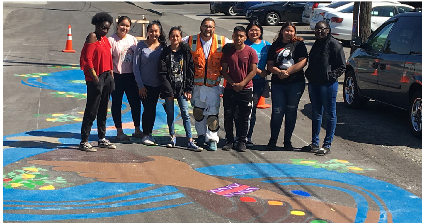
Duwamish Valley Youth Corp help design and paint a street mural