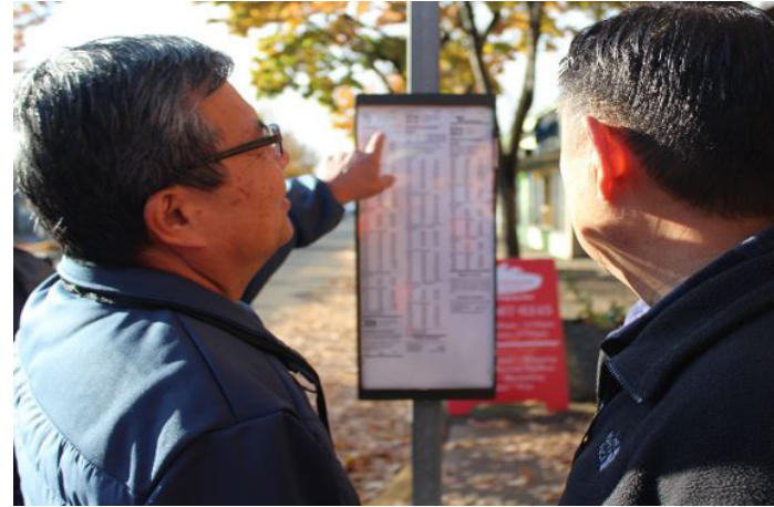
Senior Seattle residents learn how to use transit