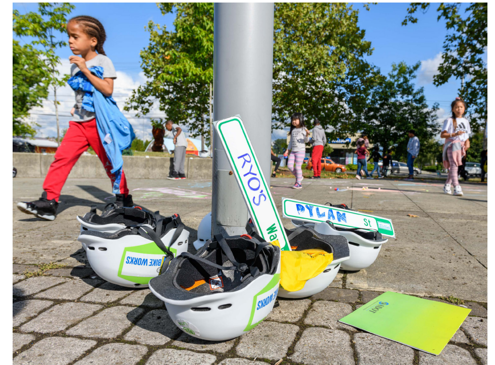
SDOT & Bike Works giveaway bike helmets