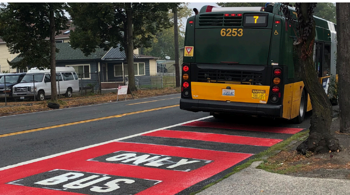
Example of red bus-only lane.

Bus-only lanes are one way we're making Rainier Ave S a more complete street by building on safety and mobility improvements built as part of the Rainier Ave S Vision Zero project and Route 7 Transit-Plus Multimodal Corridor (TPMC) project .