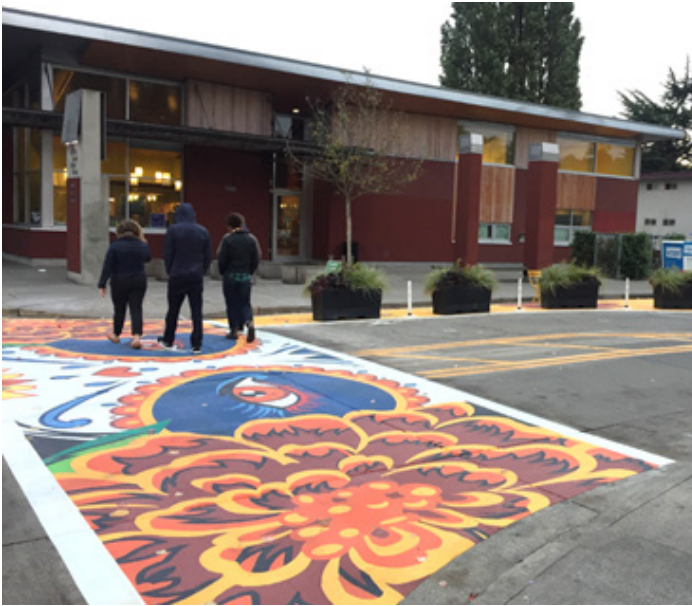
Existing decorative street design on 8th Ave S and S Cloverdale St

Based on positive feedback about the decorative crosswalks and street designs on 8th Ave S and S Cloverdale St, we're planning to extend similar art up 8th Ave S between S Cloverdale and S Southern streets. The art would be painted at the same locations as the existing painted curb bulbs with an additional decorative crosswalk at 8th Ave S and S Cloverdale St and potential painting on the new sidewalks. See map for more details, and please contact us with questions or concerns.