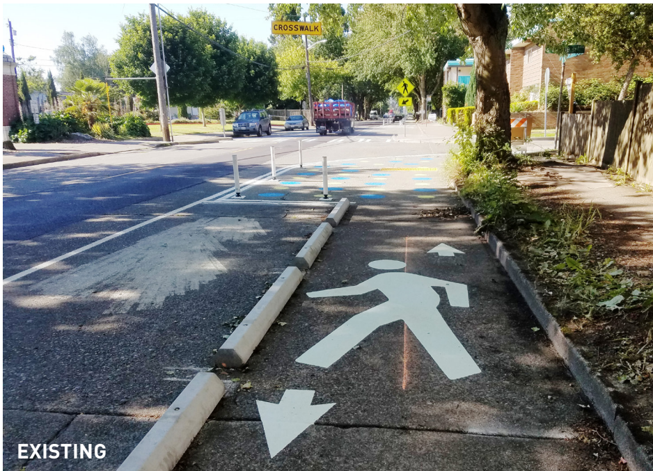
Temporary walkway where we'll build the permanent concrete sidewalk

We're also planning to incorporate decorative street designs into this project – see back for details.