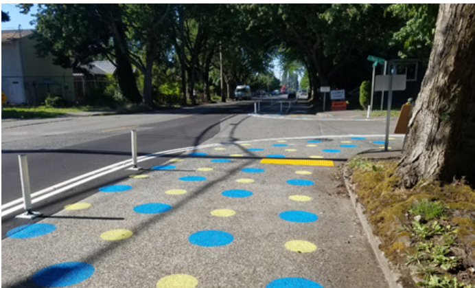
Existing painted curb bulbs where we're proposing new street art design that ties in with the art on 8th and Cloverdale