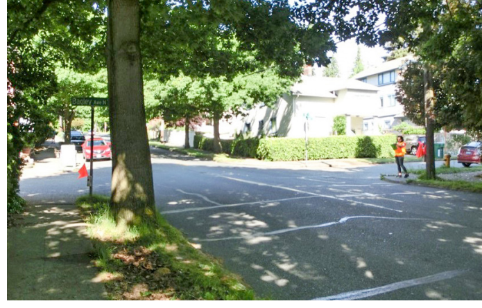
Looking west on N 40th St toward Bagley Ave N. Existing crossing flags shown on east side of intersection.