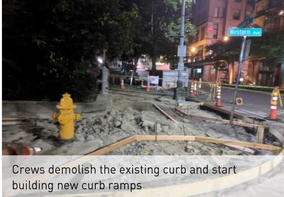
Crews demolish the existing curb and start building new curb ramps

Examples showing what it looks like when curb ramps are upgraded