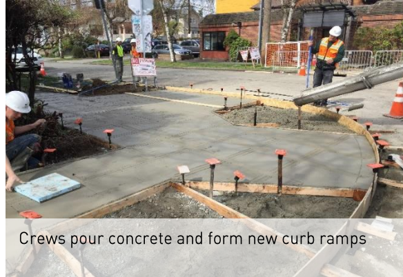
Crews pour concrete and form new curb ramps