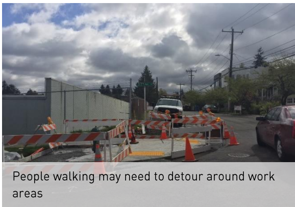
People walking may need to detour around work areas