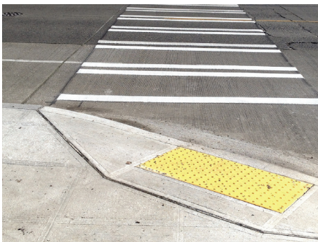
We're adding or upgrading curb ramps at intersections along Stone Way N.

WHAT WE HEARD: The turn lane on Stone Way N is essential for people driving to access local businesses.