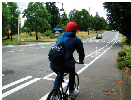
Stone Way N will have protected bike lanes from N 46th St to N 50th St!

We're also repaving and updating lane layouts on N 40th St, N 50th St, N 80th St and streets on the east side of Green Lake in the Green Lake and Wallingford communities.