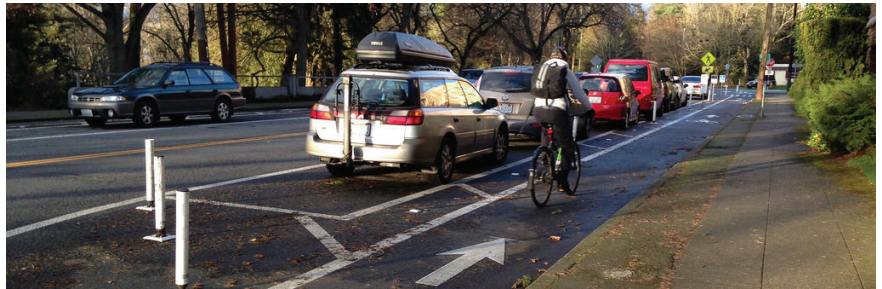
People biking will have a buffer of parking spaces between the protected bike lane and people driving in the general purpose lane.

www.seattle.gov/transportation/greenlakepaving.htm