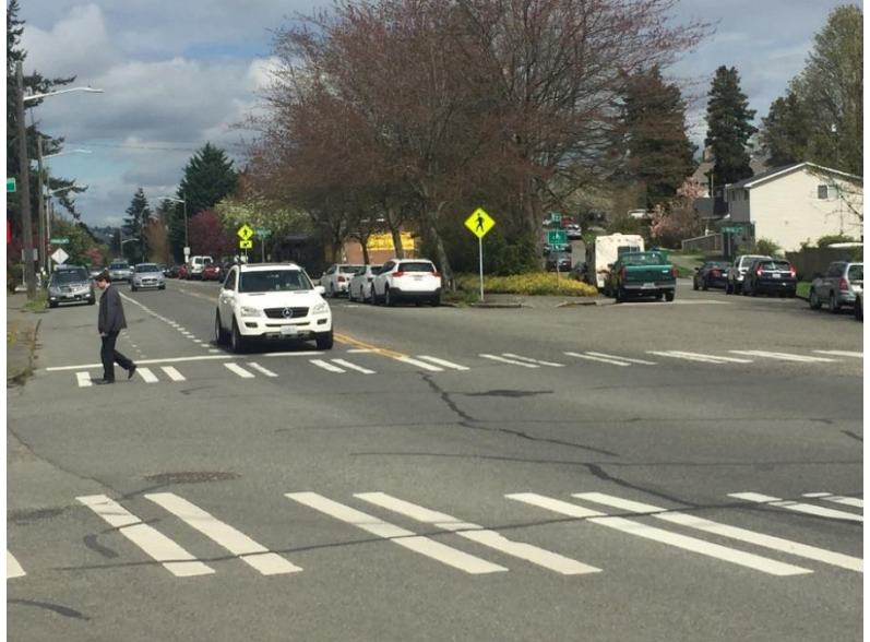
Wilson Ave S needs to be repaved