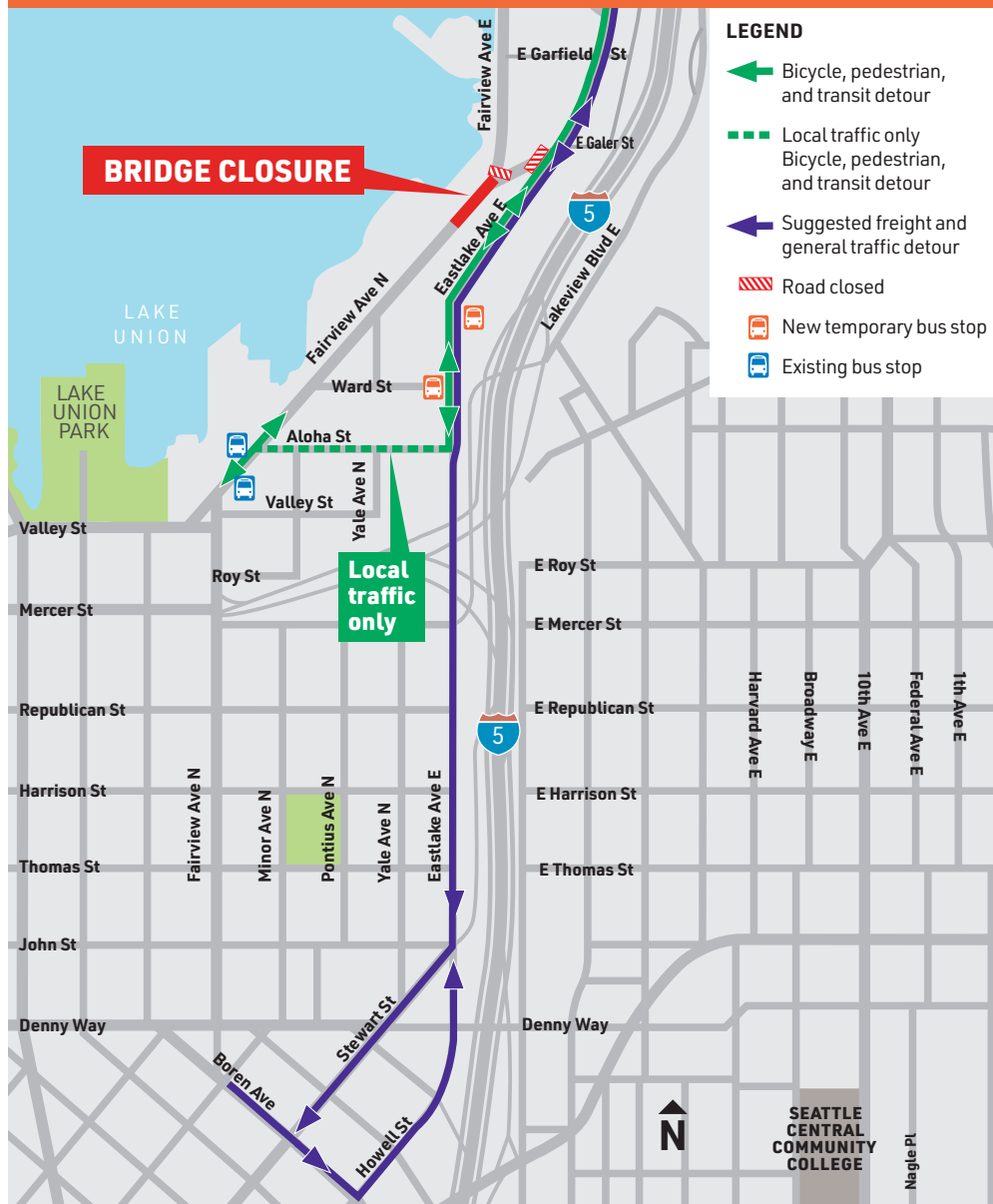
Transit, biking, walking, and local traffic detour routes shown on the map above are the result of working with communities near the bridge.