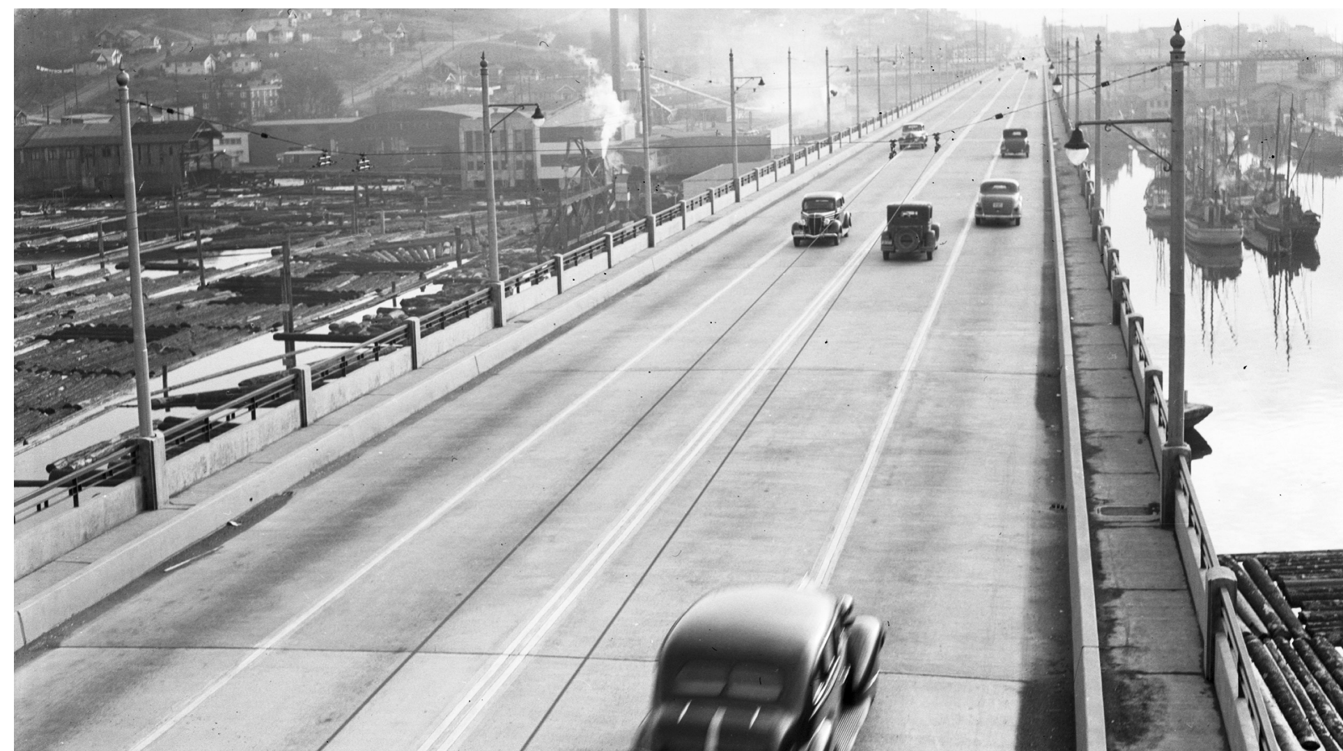
Ballard Bridge Facing North (1956)

The Ballard Bridge, built in 1917, spans the eastern edge of the Salmon Bay and connects Ballard to Magnolia, Queen Anne, and Downtown via Interbay. Today the 2,854-foot bridge carries more than 57,000 vehicles per day across the Lake Washington Ship Canal. Over the last century, while the look and function of the bridge may not have changed much, we've been retrofitting and maintaining the structure to keep it moving and safe, including a recent series of seismic improvements completed in 2014.