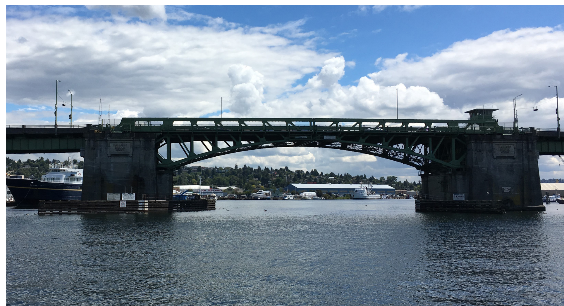
Ballard Bridge Facing East