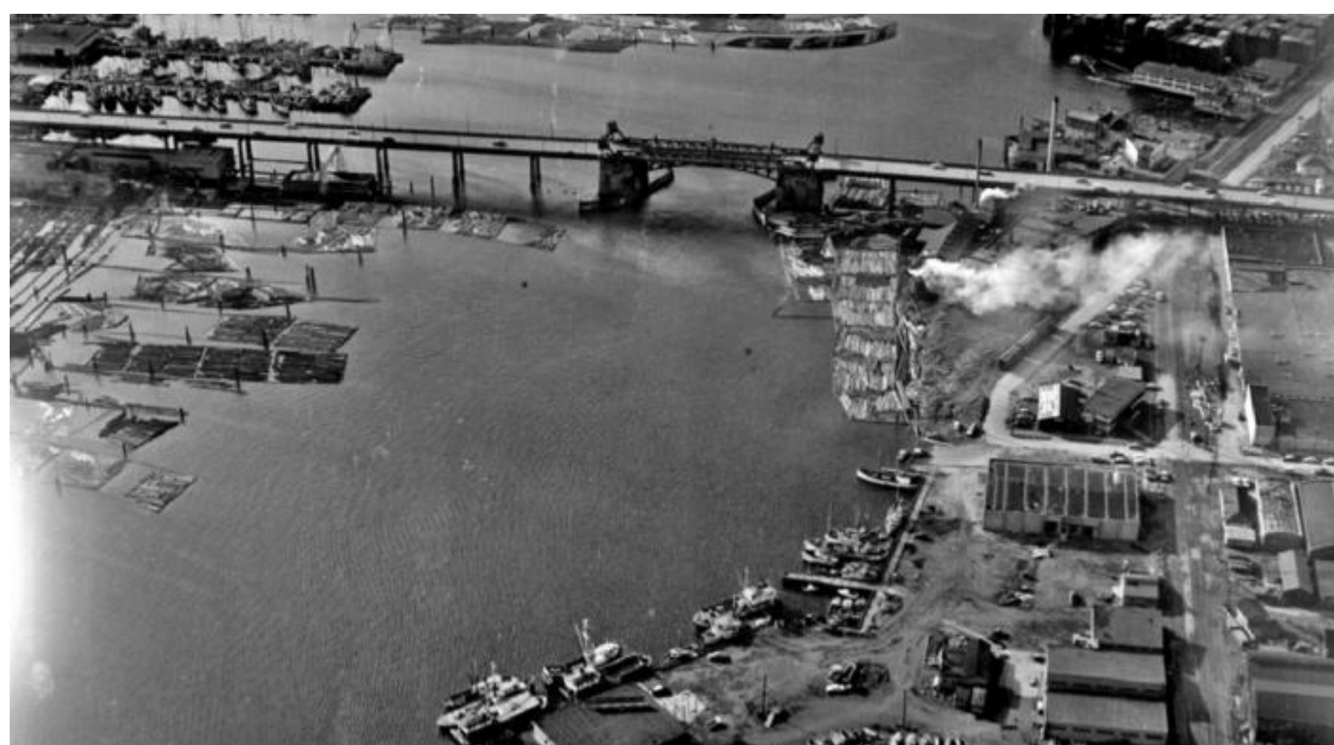
Ballard Bridge (1957)