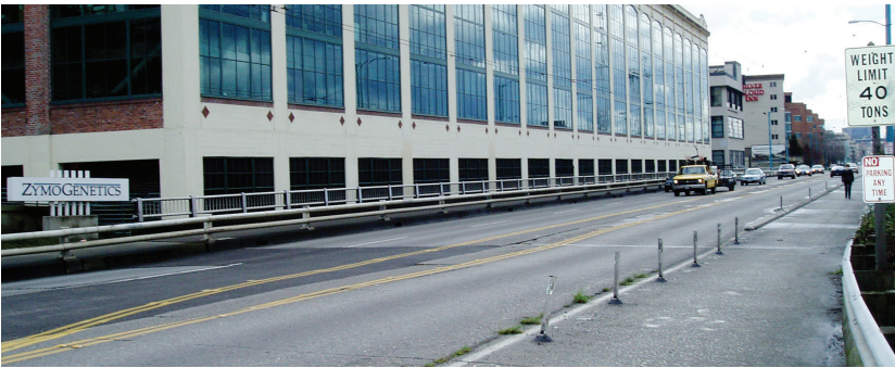
Fairview Ave N bridge directly next to the historic Lake Union Steam Plant Building.

We understand that traffic must keep moving in the area during construction. Transit riders, cyclists, and pedestrians will be directed to Aloha St and Eastlake Ave E. Freight and general traffic will be encouraged to use alternate routes. Detour and “businesses are open” signage will be placed at key locations during the full closure. We will continue to work with King County Metro, other nearby construction projects, the community, and those who travel through the area before and during construction.