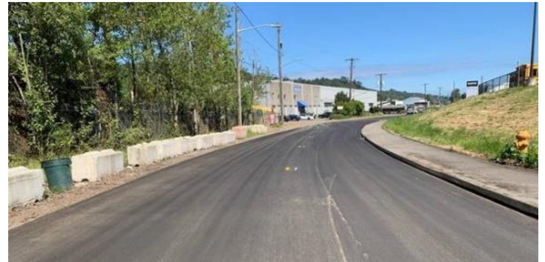
Before (top) and after (bottom) paving on Occidental Ave S between S Kenyon St & S Sullivan St.