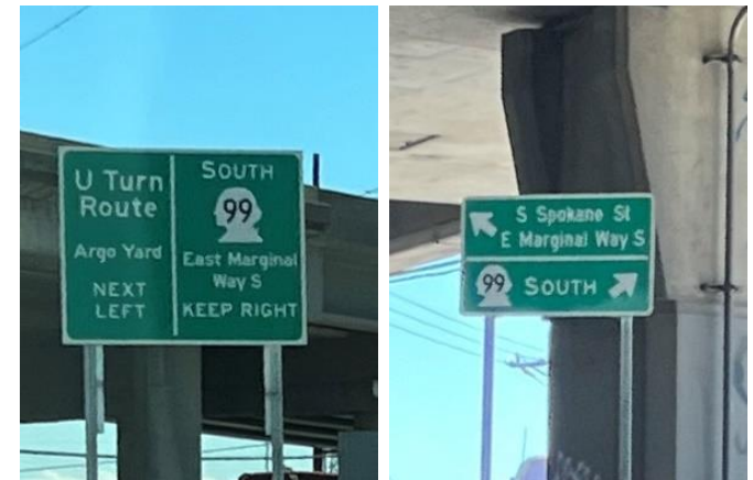
New freight signage