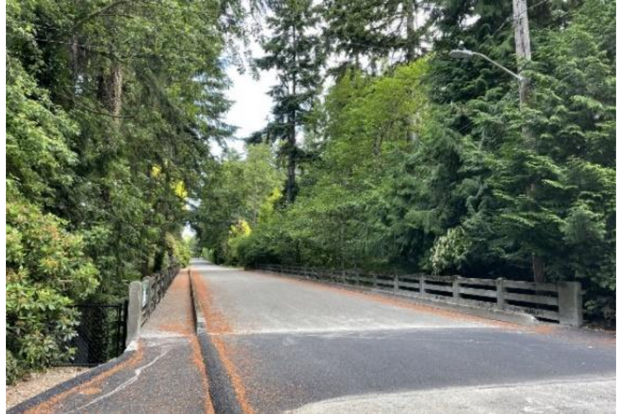
8 th Ave NW Bridge Seismic Retrofit