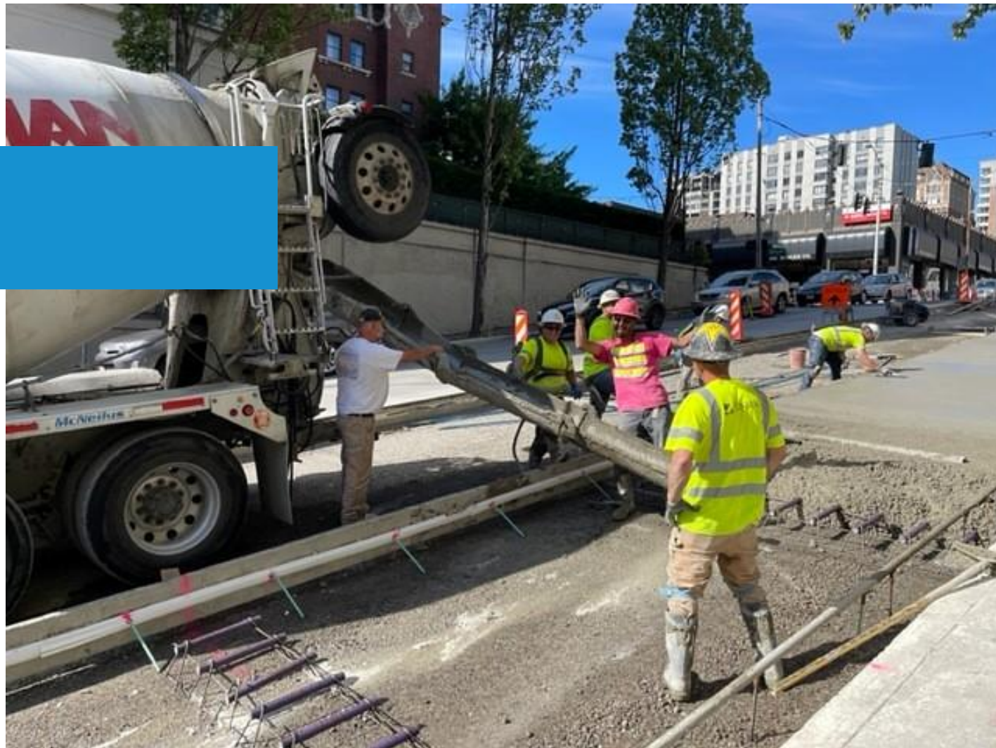
Paving on Madison RapidRide G Line project.