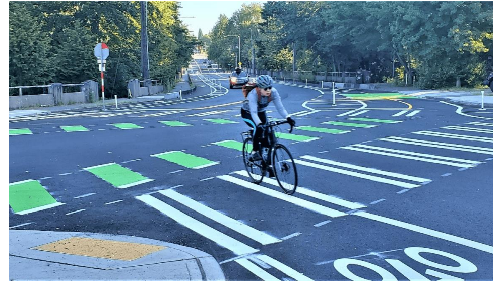
Biking improvements on 15 th Ave NE