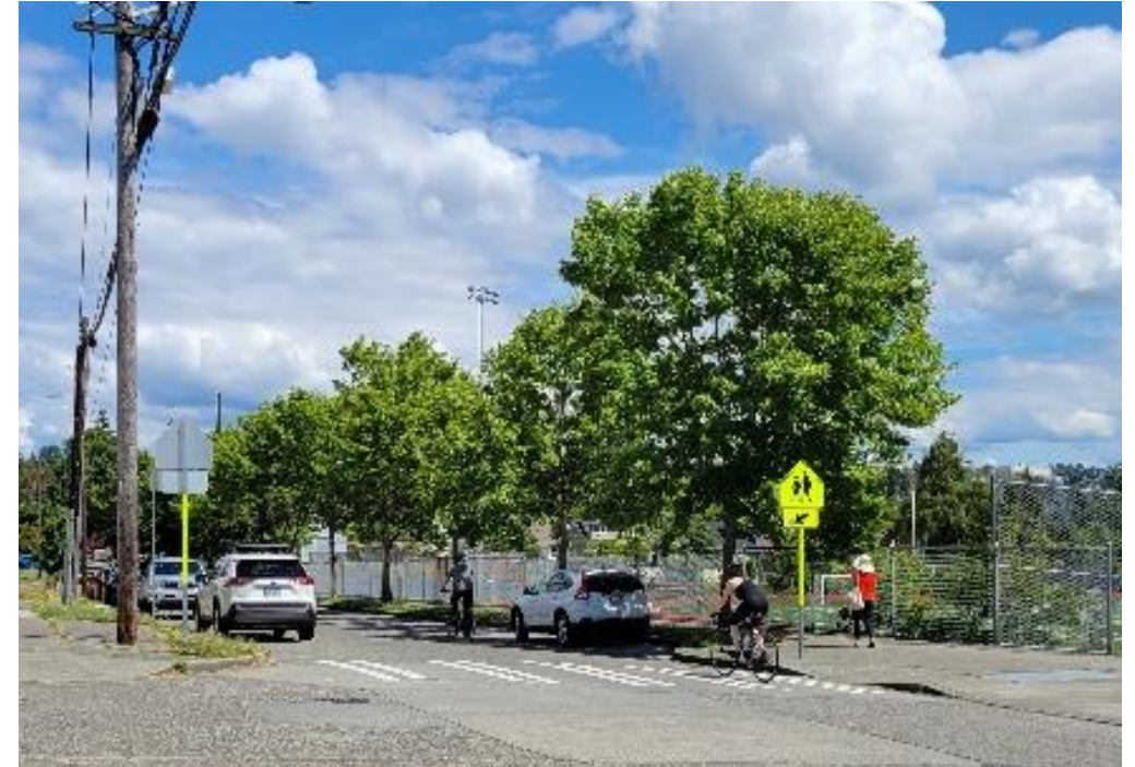
New marked crosswalk