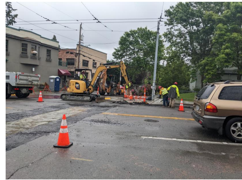
Work on 23rd Ave E and E Lynn St