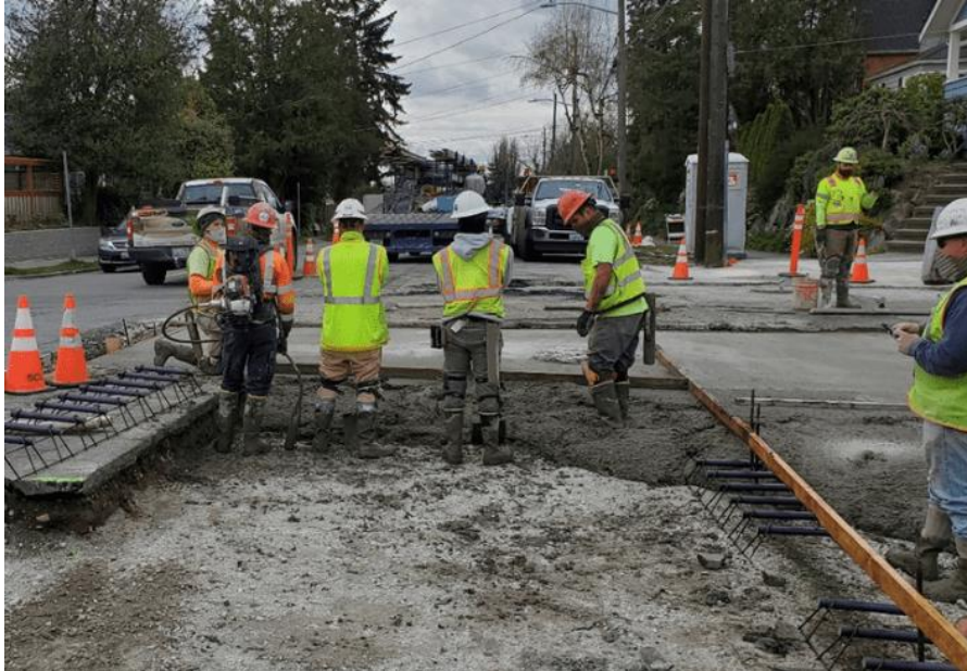
Repaving in progress on 15 th Ave NE