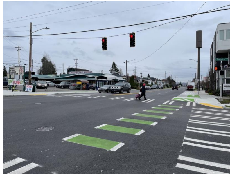
Improved 15th Ave S & S Columbian Way intersection 3