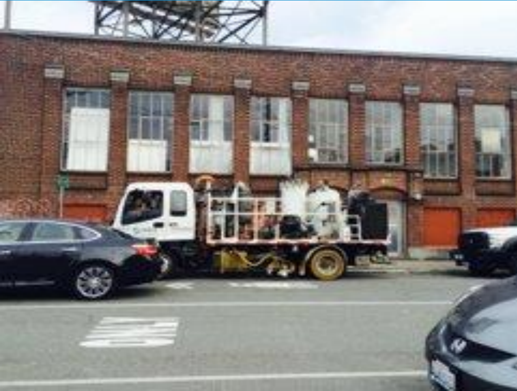
Old Truck – 20,000 LF of paint a day