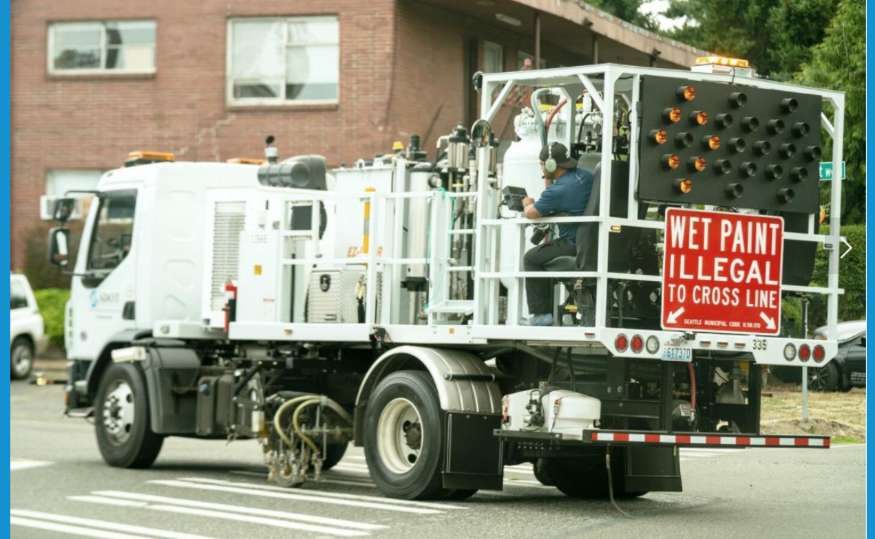
New Truck – 80,000 LF of paint a day