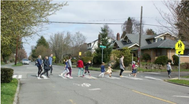
Loyal Heights Elementary School families using a new crosswalk across 32nd Ave NW during a recent school Move-A-Thon. The crosswalk was funded through our Safe Routes to School program. Ada Meyer, a third-grader at Loyal Heights Elementary School, said, "I love our new crosswalk! The cars stop for us and let us safely cross the street. I can't wait to go back to school next week."

Program 1 | Safety Corridors: Work is underway on the 12th Ave S Vision Zero project, the first of three projects planned for 2021. Crews also continued installing 25 MPH speed limit signs across the city, and, in total, have installed signs on more than 90% of Seattle-owned arterials and on the first phase of state-route arterials.