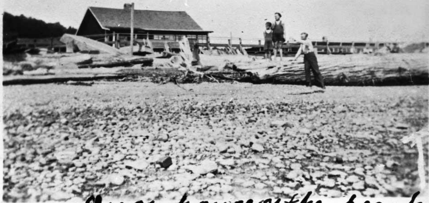
Our house on the beach