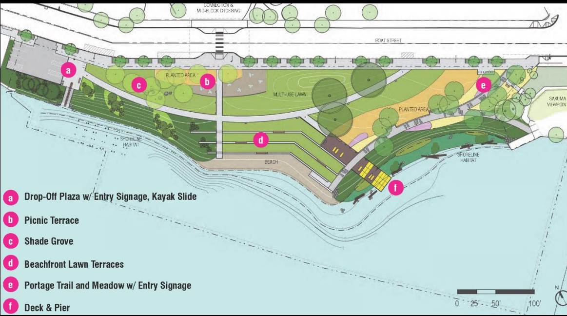
Portage Bay Park 1.65 acres, $9 million