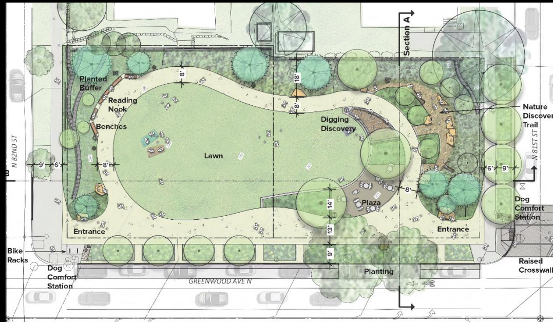
Greenwood-Phinney Park 0.5 acres, $924,000