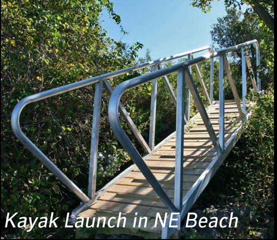
Kayak Launch in NE Beach