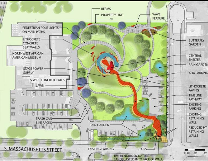
Jimi Hendrix Park 2.5 acres, $2.2 million