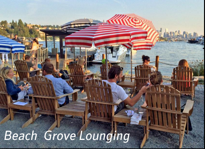
Beach Grove Lounging