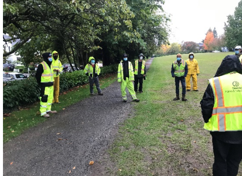
Group 1 Hedge trimming