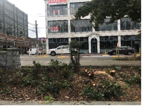
Brush removal and clean up