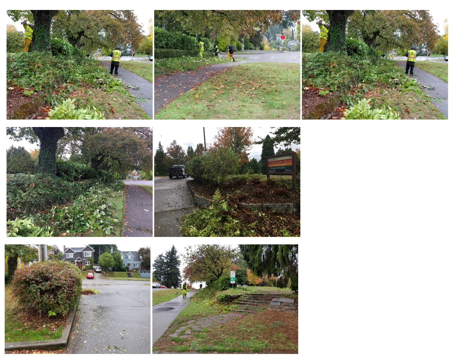
Group 2 Bridge overpass, shrub bed maintenance and tree pruning