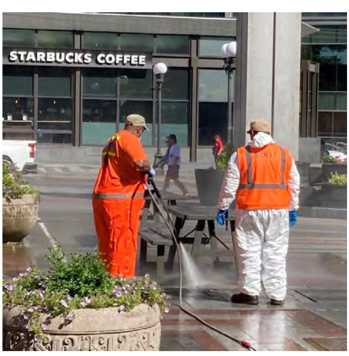
Westlake Welcoming Event