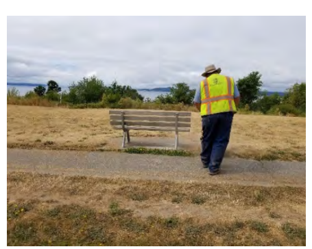
Blowing parking lot at Magnolia Blvd Park and Edging project completed