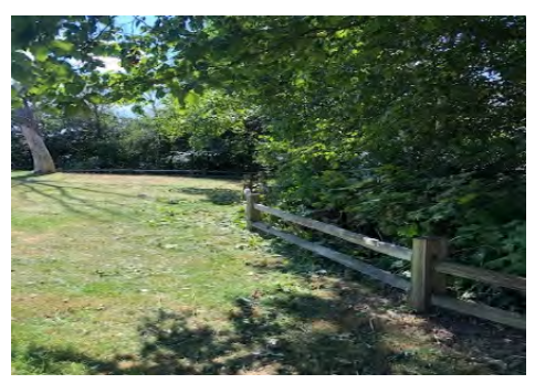
Tree limbing and pruning