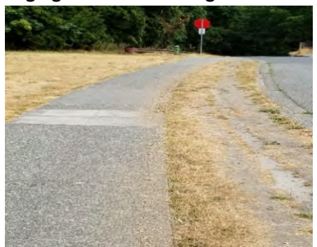
Edging 1st stretch of Magnolia Blvd starting at Magnolia Blvd Park Section 1

• Magnolia Blvd: 7/20. CW Jamboree was held at Magnolia Blvd with only 4 crew members edging 2.4 miles of the strip. The Blvd strip was divided into 3 sections of edging.