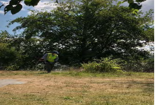
Edging seating area