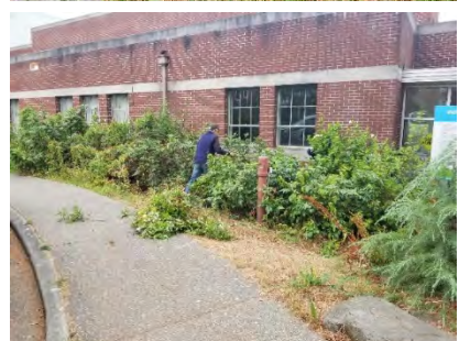
Work in the Native Circle bed - Before