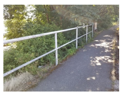
Before Work Along Rainier Ave So.

Chinook Beach Park: 6/17. Southeast District hosted a jamboree at Chinook Beach Park with staff from 7 Park districts supporting the project. There is a steep slope along most of the top edge along Rainier Ave So, some garbage and evidence of camping activity on the south end. The slope grade prevented staff from accessing portions of the park, however, the vegetation management work on the bottom hill side has been completed. This is considered a natural area and the Natural Area Crew (NAC) works on site periodically. The lower portion of this park has pebble rock beach access with opportunities for recreation. Parks crews cut down vegetation and lifted trees on the slope side so to expose the former fence posts and allowed the crews to remove debris.