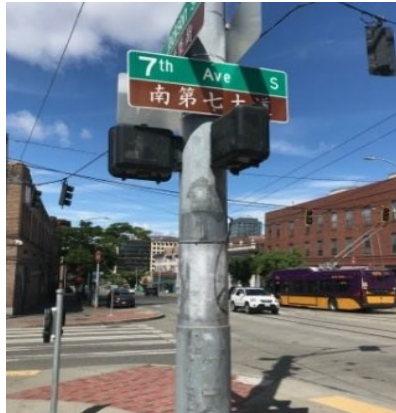
7<sup>th</sup> Ave S & S Jackson St