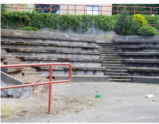
After Line Trimming Upper Walkway and Amphitheatre Stairs