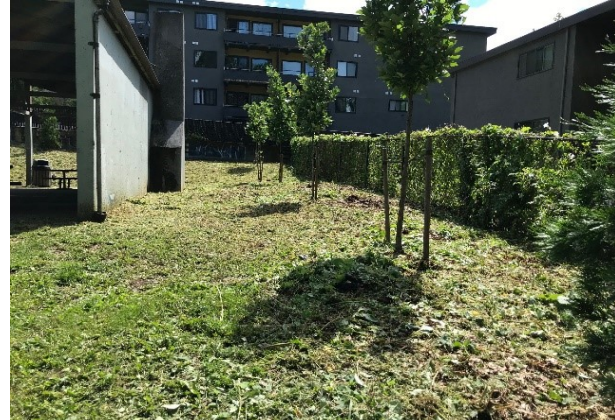
Removing Ivy from Trees