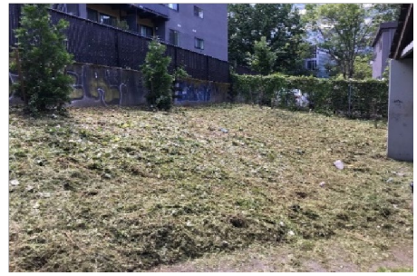
South Fence line Before and After