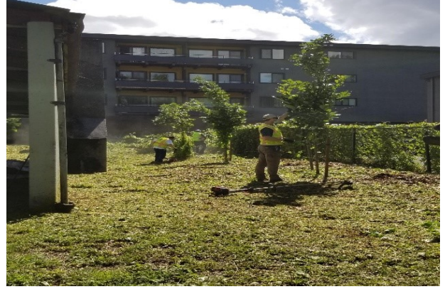
Line Trimming Walkway