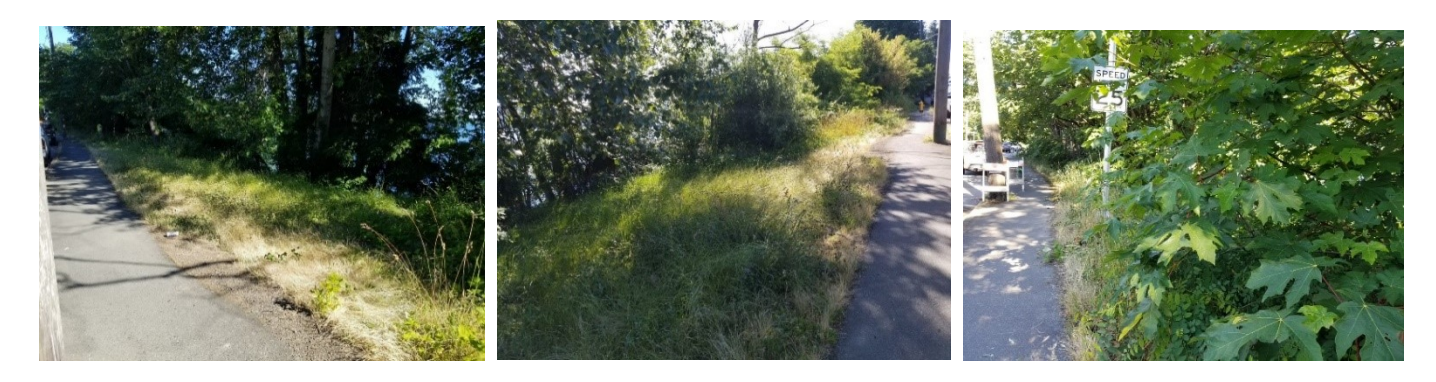
Work Along Rainier Ave. So., Line trimming, Mowing, and Pruning