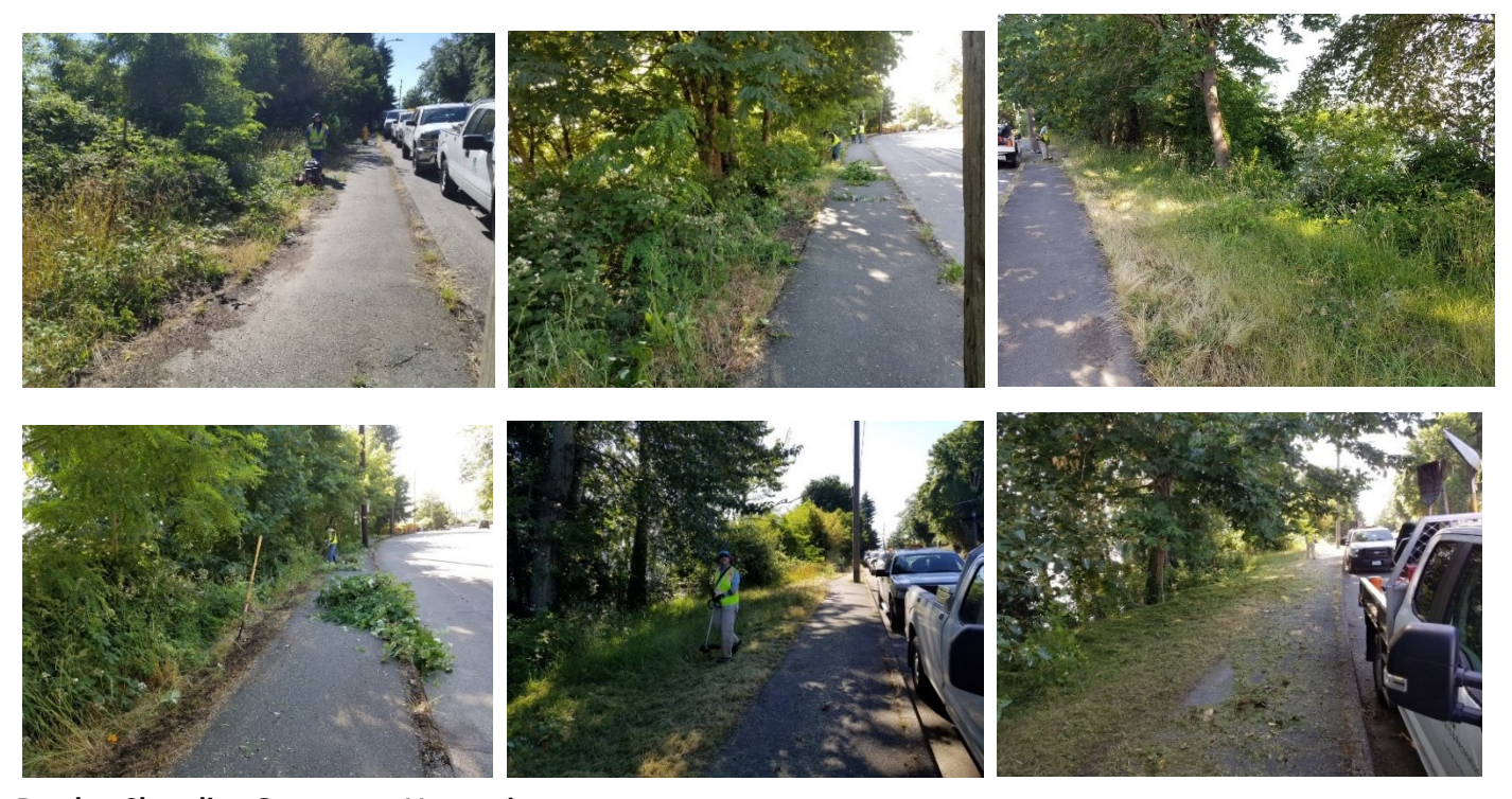
Road to Shoreline Overgrown Vegetation