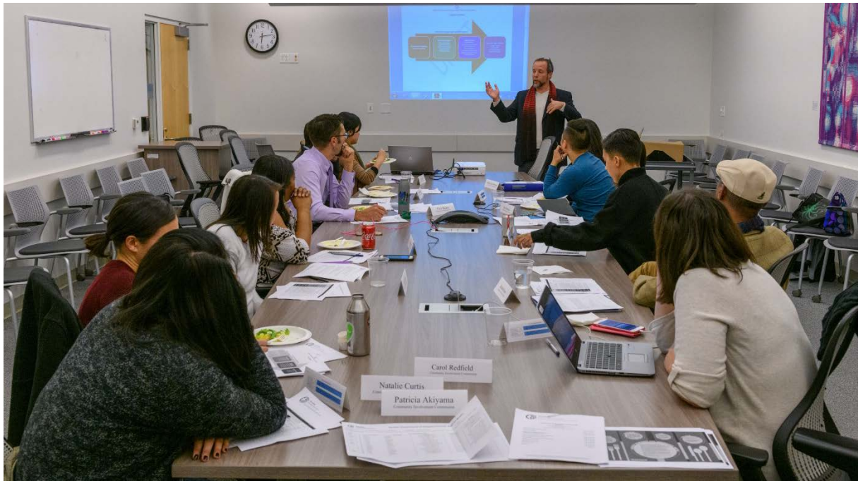
Employment Pathways Interdepartmental Team presenting to the Community Involvement Commission

“Your Voice, Your Choice (YVYC) staff attended a Community Involvement Commission meeting to present on the formation of an Outreach Steering Committee that would represent leaders in communities across Seattle. The commission advised that the structure placed unnecessary burden on uncompensated volunteers and cautioned this would not result in equitable outcomes. YVYC staff redesigned the structure and the scope of work to create a compensated community body to advise, guide and assist on key programmatic concerns related to equity, the funding structure, outcomes and accountability.”