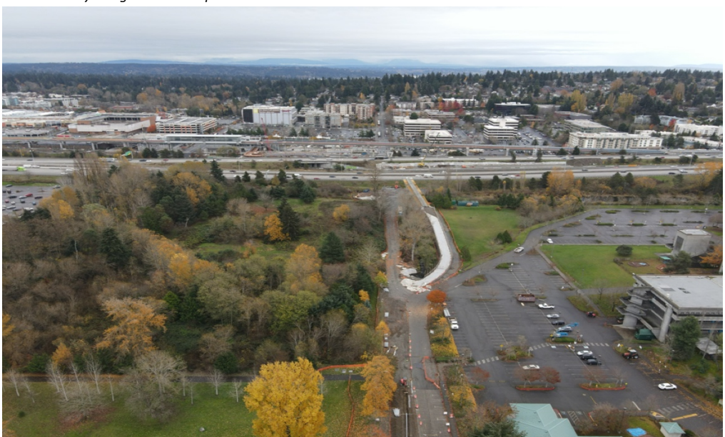
Pedestrian Sky Bridge North Campus

NSC has not implemented this program element due to lack of funding. Bus route #26 provides a connection to the campus and the Pedestrian Skybridge will meet this need Fall of 2021.