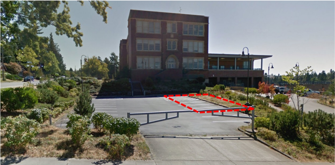
Exhibit 2 Existing Site Plan

Madison Middle School’s site is bifurcated by a steep slope running north-south at roughly the site’s midpoint. The original building and addition sit at the top of the slope to the east and the athletic/track field sit down the slope to the west. It had a major remodel and addition in 2005. The school is in a predominantly single-family residential neighborhood; the current zoning classification of the school site and surrounding areas are SF5000 (residential single-family 5,000).