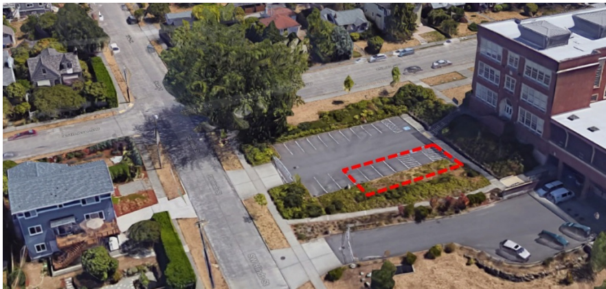
Exhibit 1 Proposed Site Plan

Enrollment projections beyond 2018-2019 show continued increase and continued need for the portables. Although the timeframe for removal of the portables is unknown, the Seattle Public Schools Capital Planning is evaluating long-term solutions to capacity at Madison Middle School.