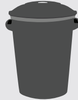
32 Gallon Can