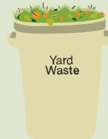
32 Gallon Can