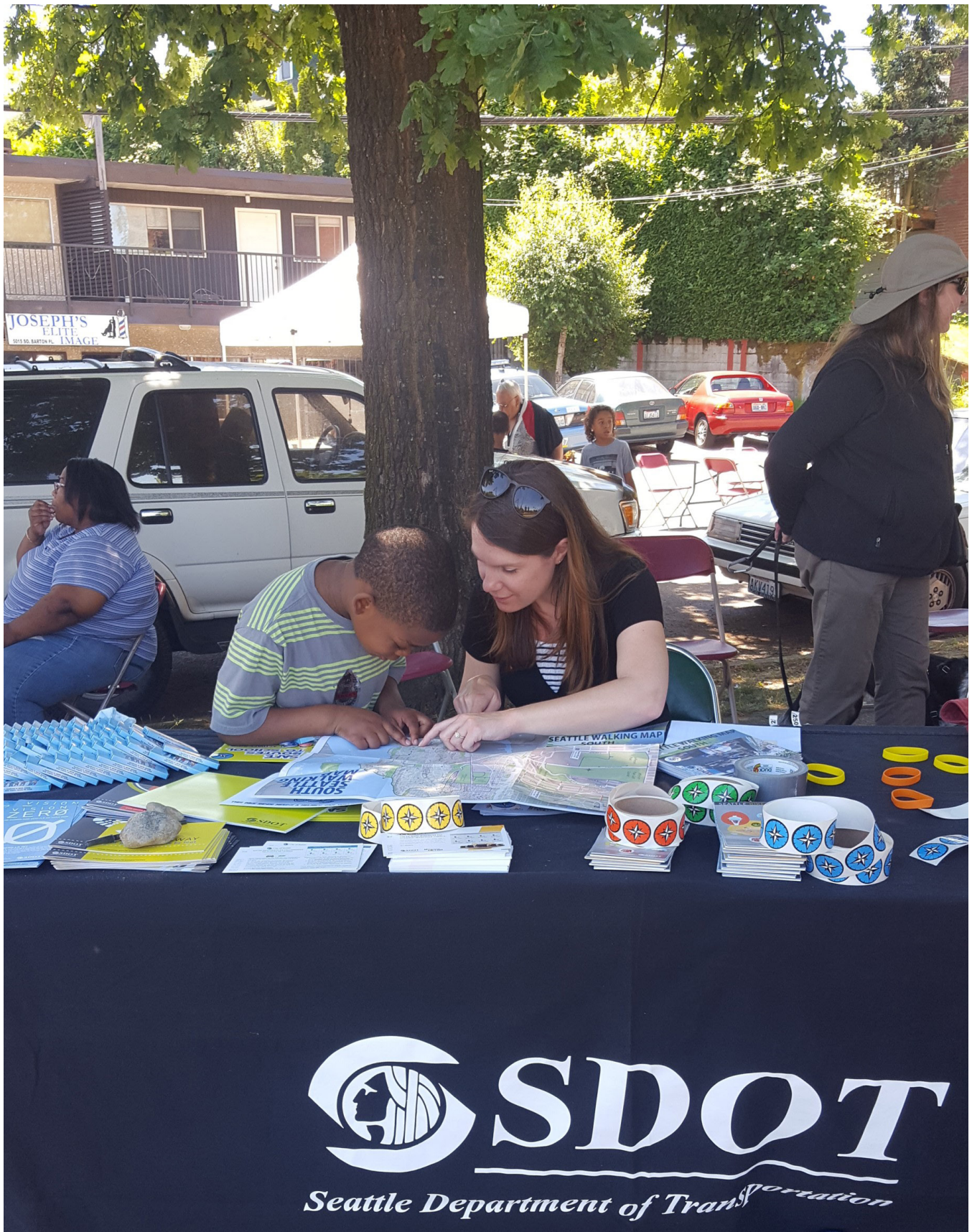
SDOT staff talking about safe routes at the South Shore K-8/Rainier Beach Block party.