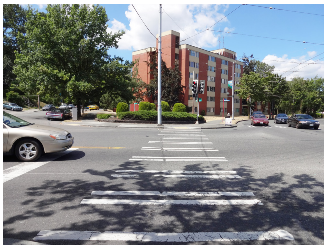
Rainier Ave S & 51st Ave S Before