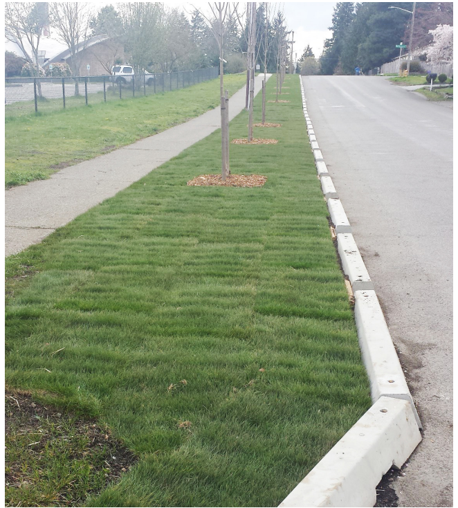
Ingraham HS After