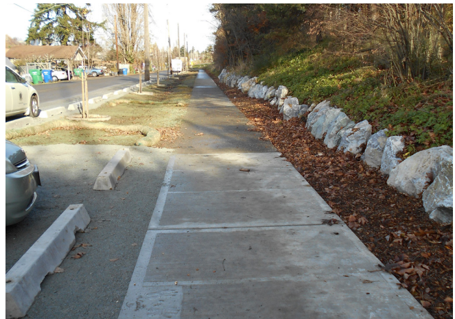
Mercer MS 16th Ave S After