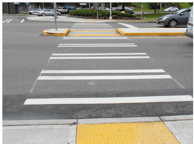
Rainier Ave S & 51st Ave S After