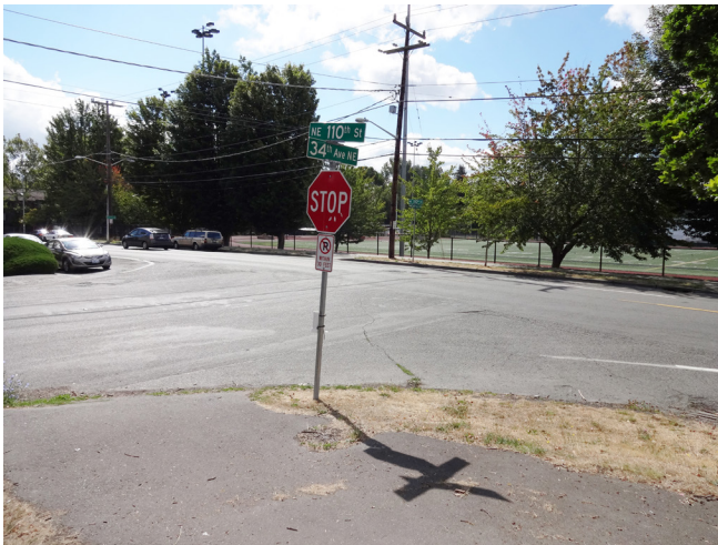
Jane Addams MS NE 110th St & 34th Ave NE Before