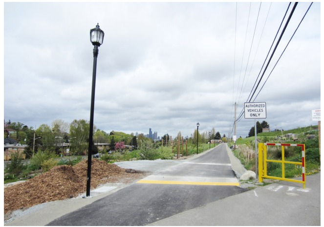
Mercer MS Jefferson Park Trail After