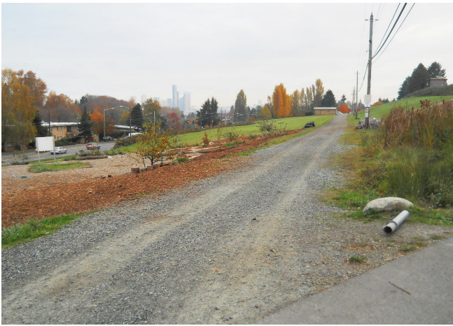
Mercer MS Jefferson Park Trail Before