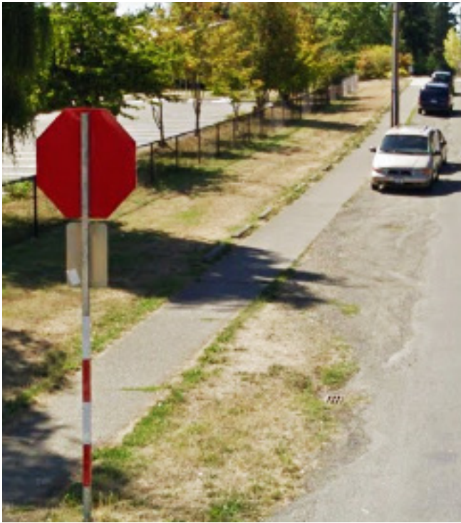
Ingraham HS Before