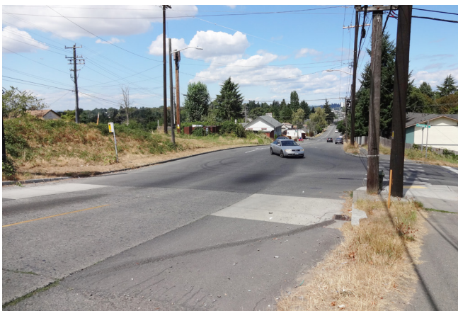
Rainier View Before