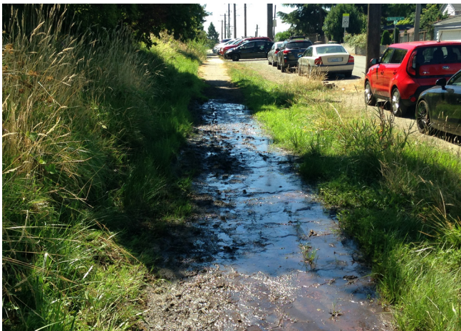
Mercer MS 16th Ave S Before