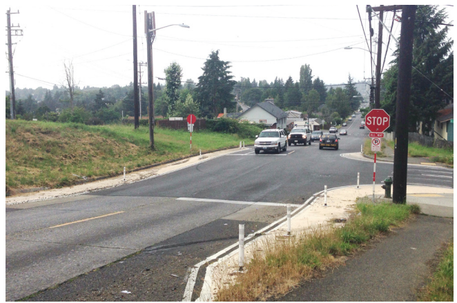
Rainier View After