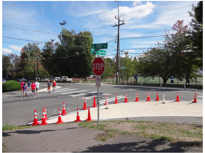
Jane Addams MS NE 110th St & 34th Ave NE After