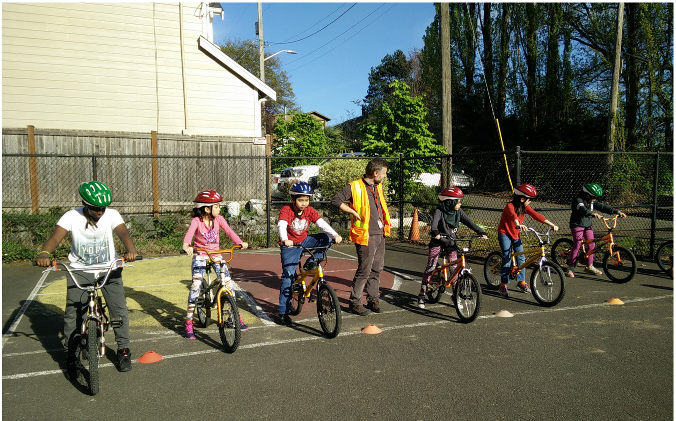
We Create the Wheel students receiving on-the-bike safety training.