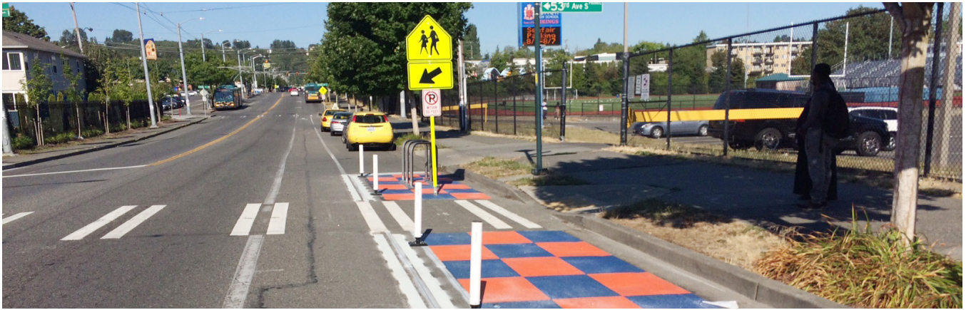
Rainier Beach HS After